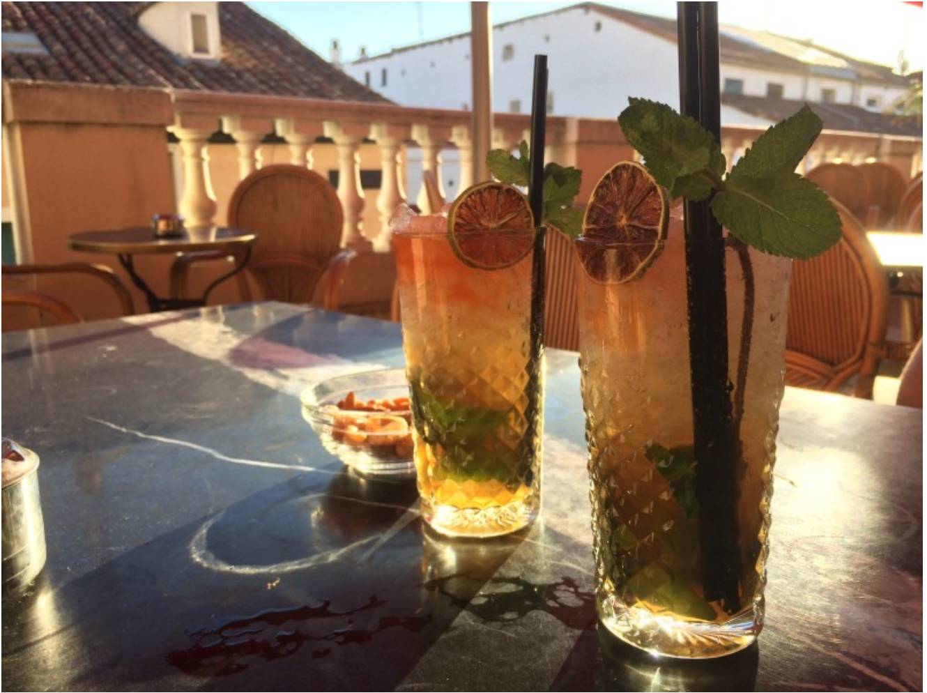
Mojitos at Cubanismo, a rooftop bar in Malasaña

When it comes to shopping, I like getting it over with in one shot on Calle Fuencarral (which merges with Gran Vía if you want to hit all the big stores like Zara and H&M). Afterwards, there's beer and tapas waiting for you at some of our favorite spots. I recommend going into one of the happening food markets in the area – Mercado de San Ildefonso or Mercado de San Anton – both with great outdoor seating areas.