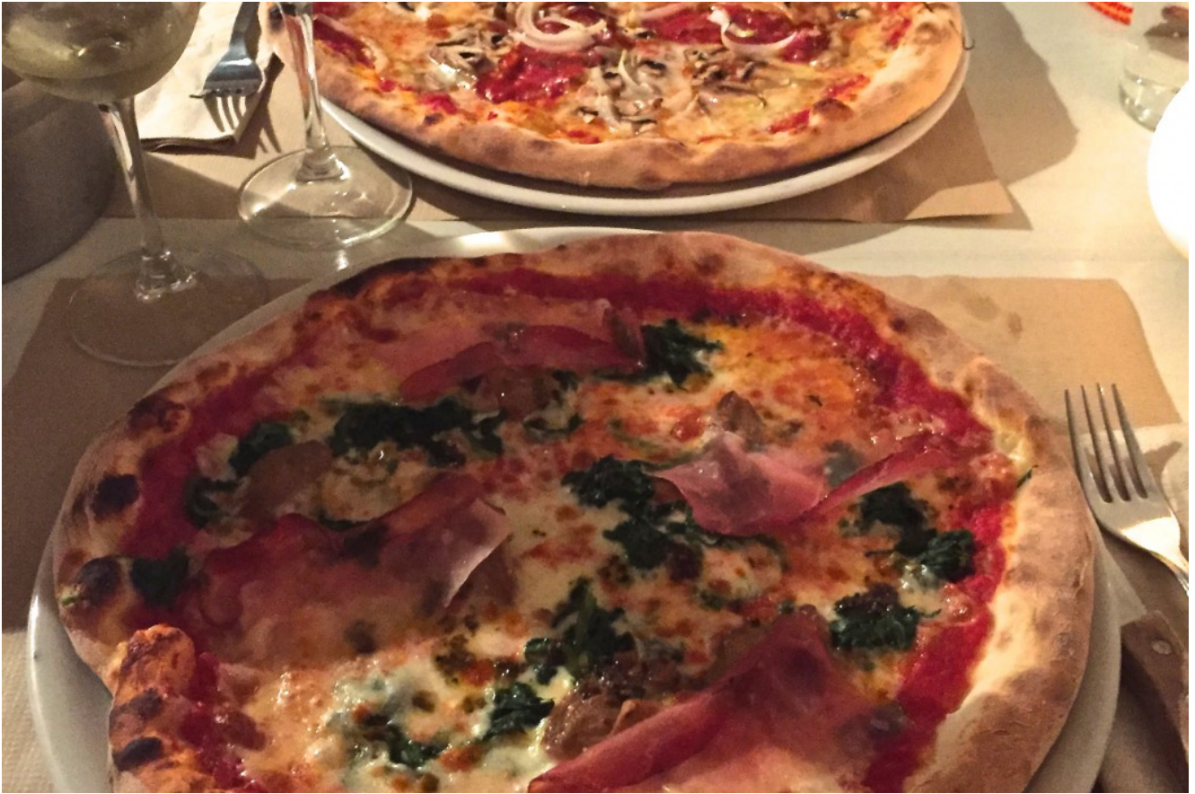
Casa dei Pazza