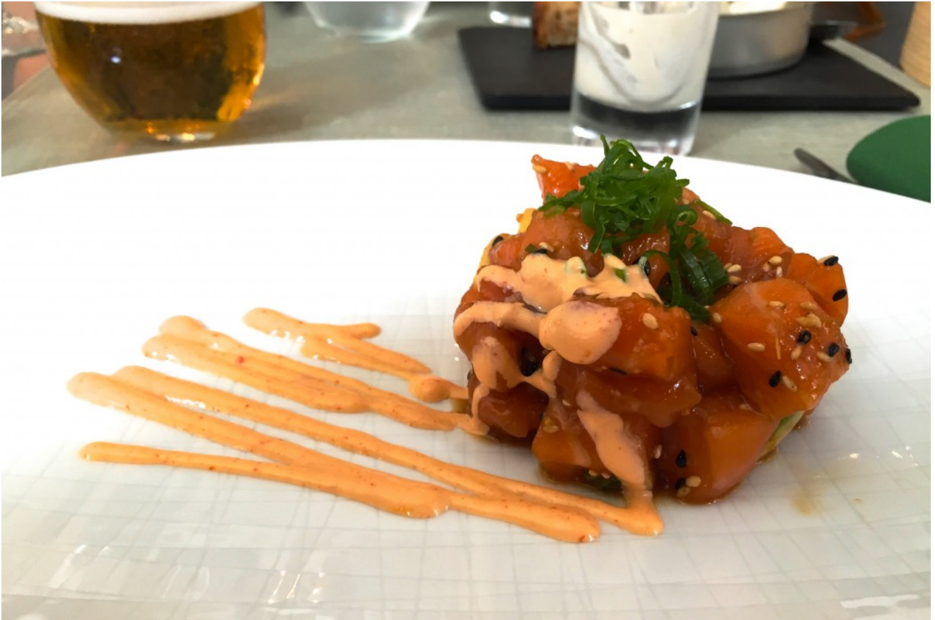
Asian-fusion ceviche at Bacira