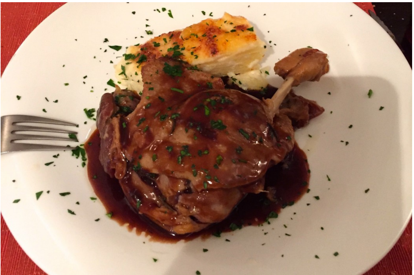
Duck confit at Gabriel