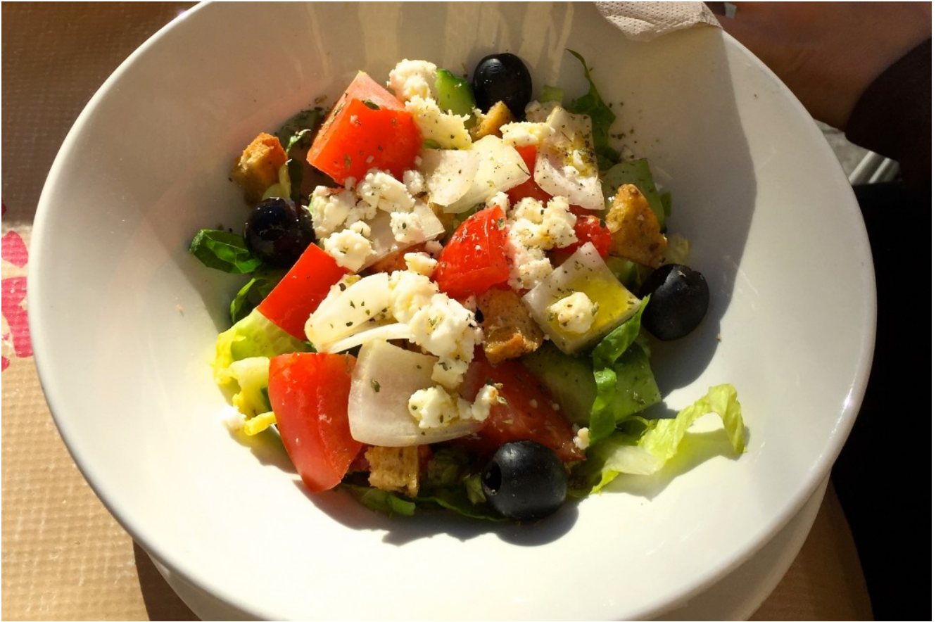
Greek salad starter at La Mucca, Malasaña