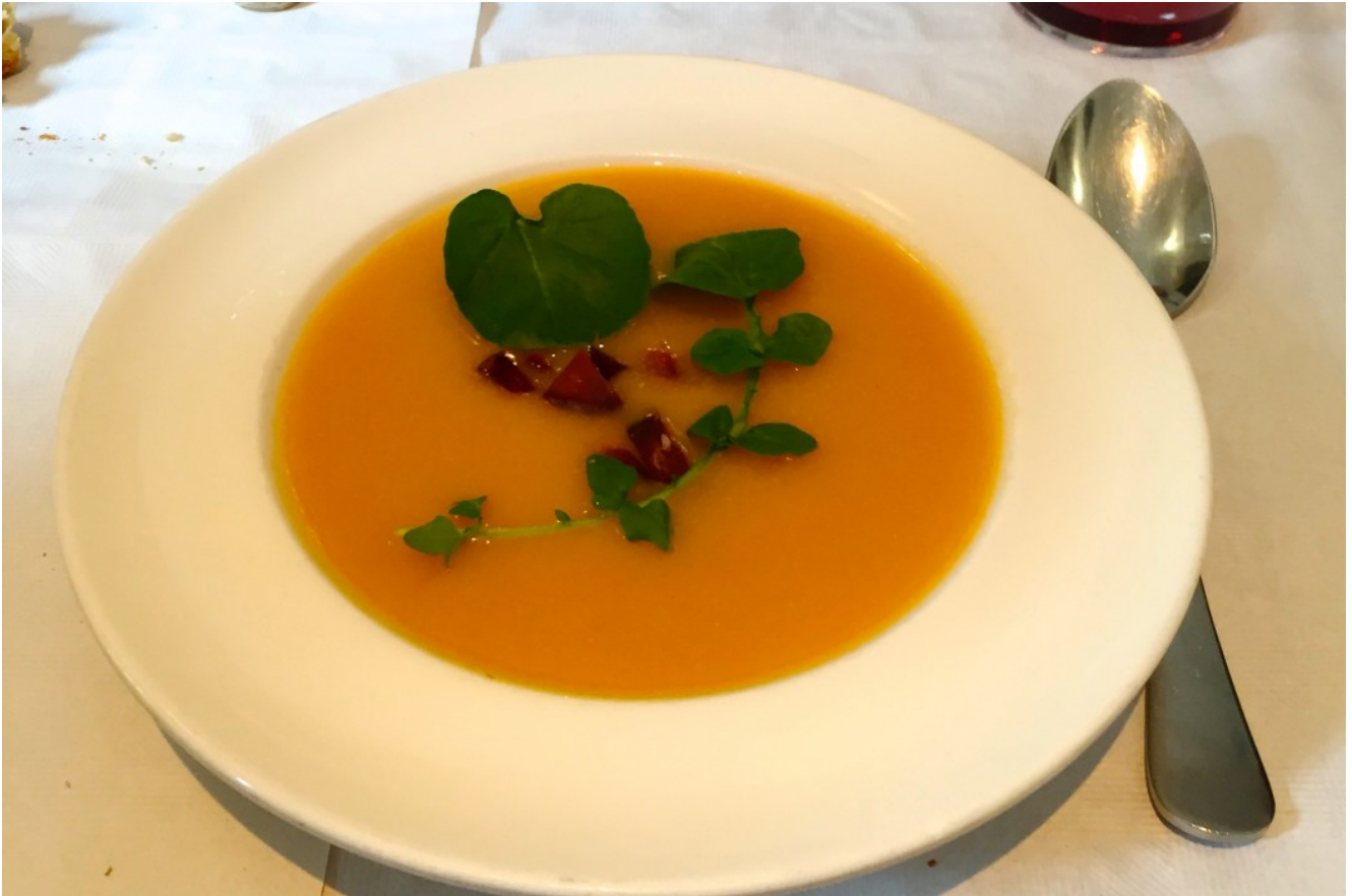
Badila crema de calabacín