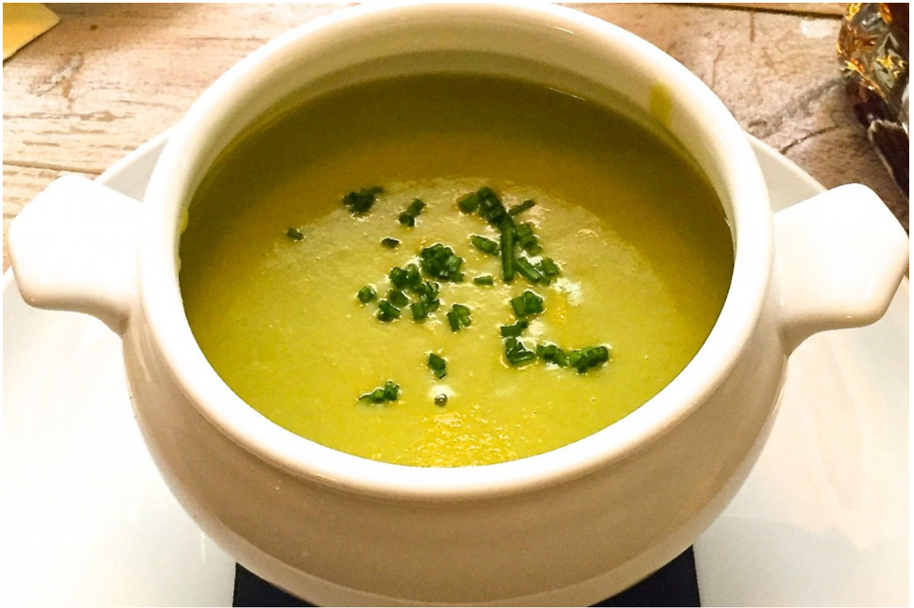
Bar Galleta crema