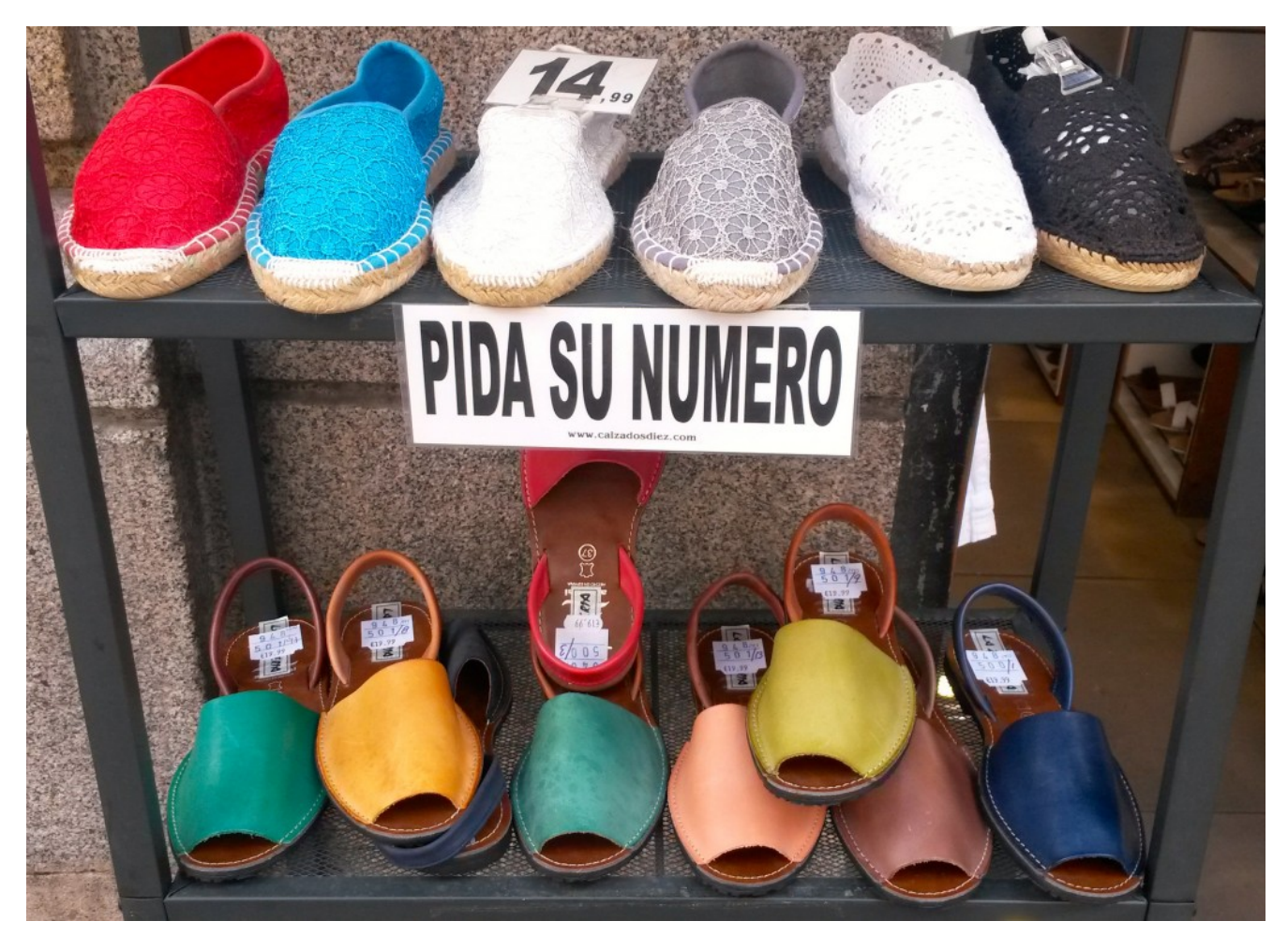
alpargatas at the top and mallorquinas at the bottom

Esparto (espadrilles), alpargatas and mallorquinas are the three most popular summer shoe styles originating from Spain. All can be found in any colour and in any standard shoe store (the center is littered with typical shoe stores, especially around Plaza Mayor and Calle Carmen which is right off of Sol). The latter two styles are unisex, so you're bound to find something for both your male and female friends and family. Since Spain is well-known for its amazing shoes, why not wow them with some Spanish summer footwear they can strut around their own city in style? Plus you don't have to limit yourself to the traditional ones. You can find snazzier versions too. You can also check out our post on "<u>3 Places to Find Espadrilles in Madrid</u>" for more recommendations.