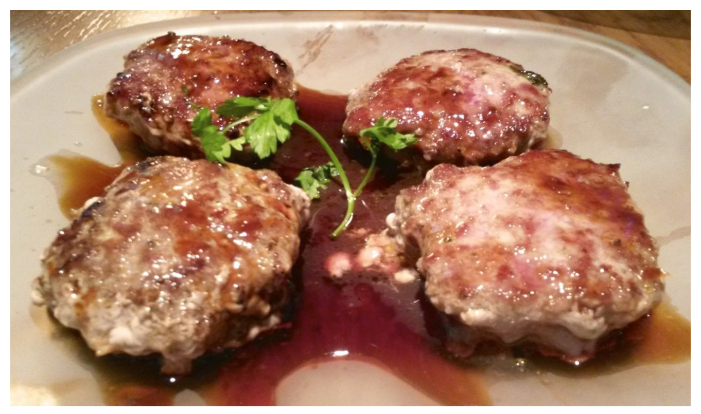
mini hamburguesas con reducción de Pedro Ximenez (sherry reduction)

Although the Spanish passion for croquettes is not always understood by foreigners, las croquetas de jamón are a must here too, as are the albóndigas (meatballs). Since I always order them both, last week I decided to venture out a bit and went for the mini-hamburgers instead, and wow, that was a good choice. They're served with a reduced Pedro Ximenez (sherry) sauce which you can sop up with bread.