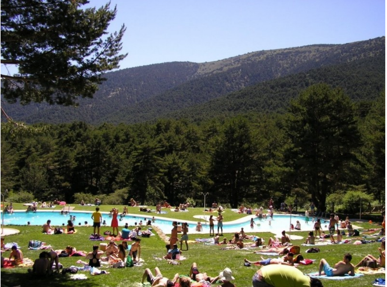
Cercedilla