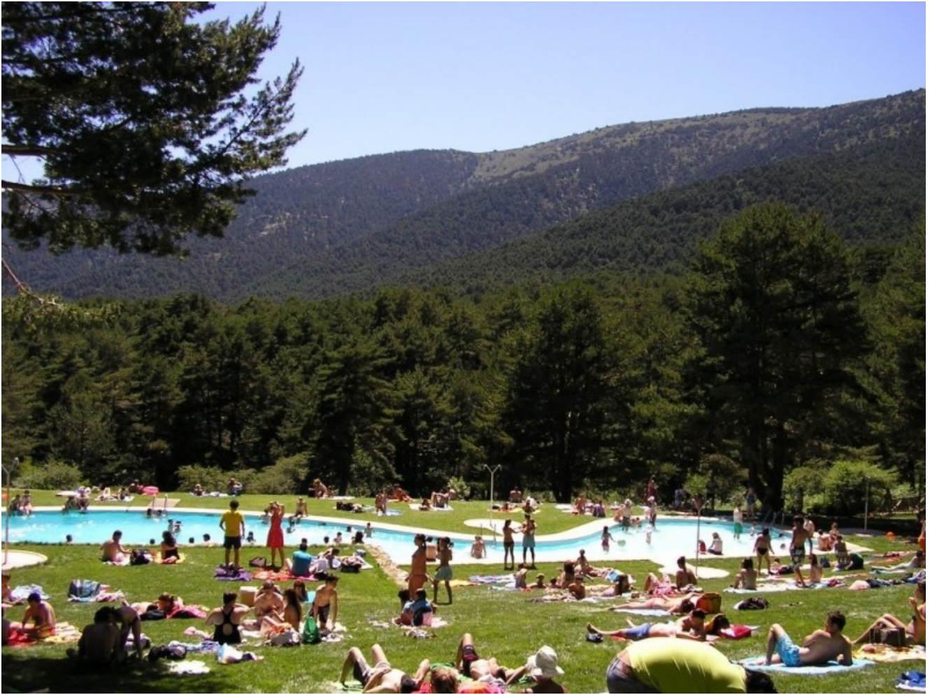
Cercedilla