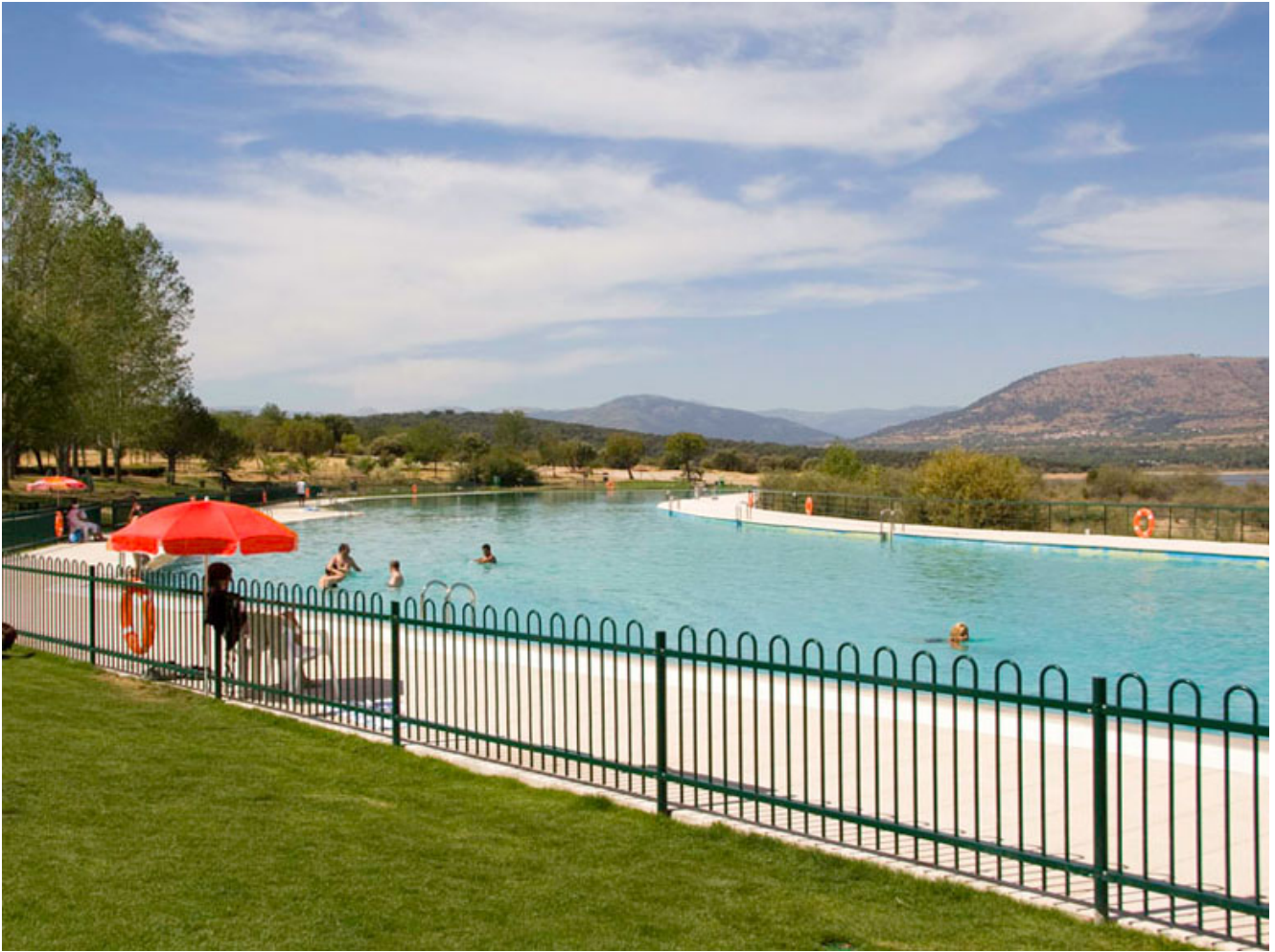
Buitrago de Lozoya by Canalgestión