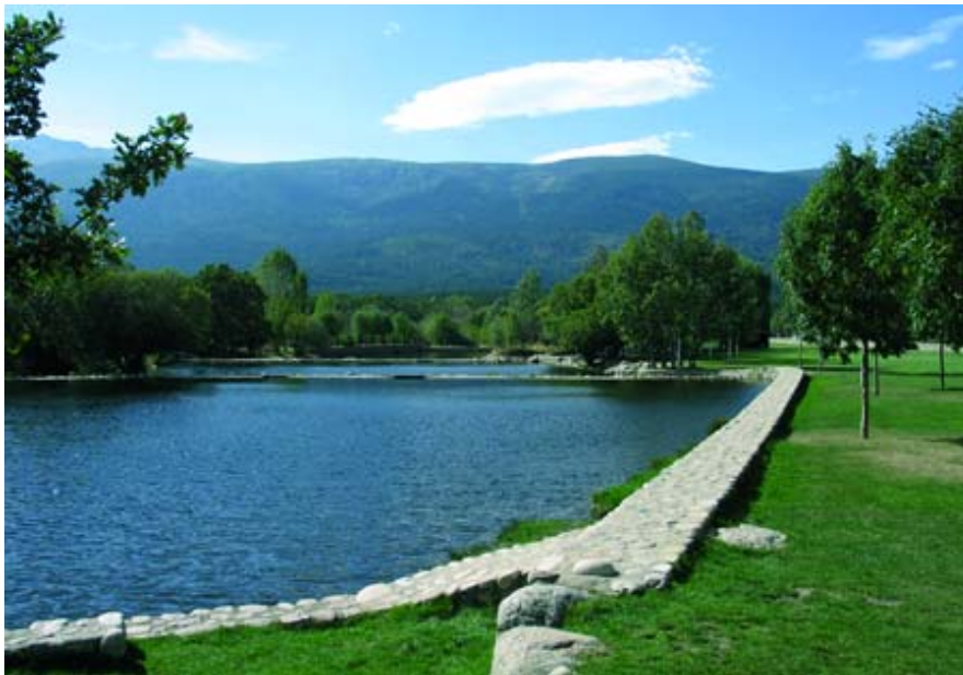
Rascafría by rascafría.eu