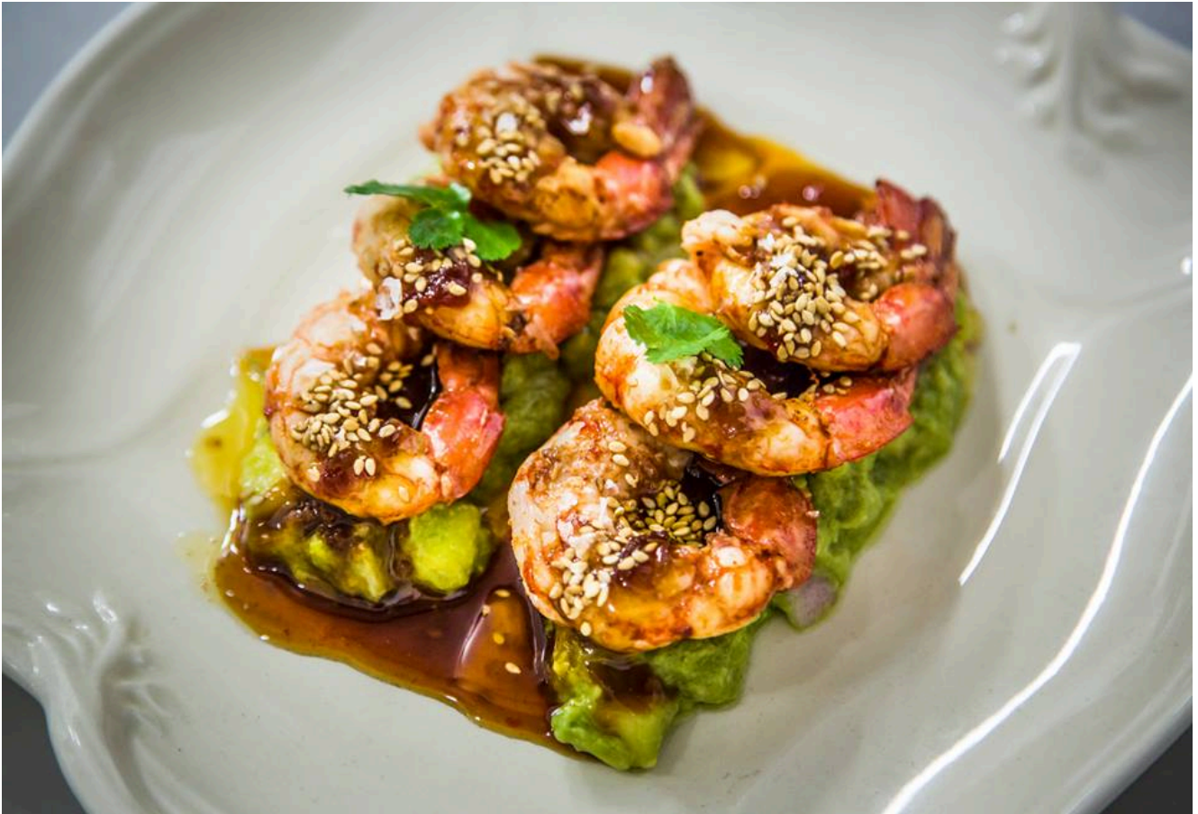
Gambones a la brasa – grilled shrimp

I was warned by the hip (but not scarily so staff) that if you want a table on a Saturday night you need to be booking up about a week in advance. My concern is that after a rave review that might up the ante to a fortnight. Either way, Lady Madonna is the kind of place that cocoons you with its culinary chicness but has you pining for your Oysho jammies by the time you pay the bill (or maybe that's just me/an attack of my eyes being bigger than my belly!).