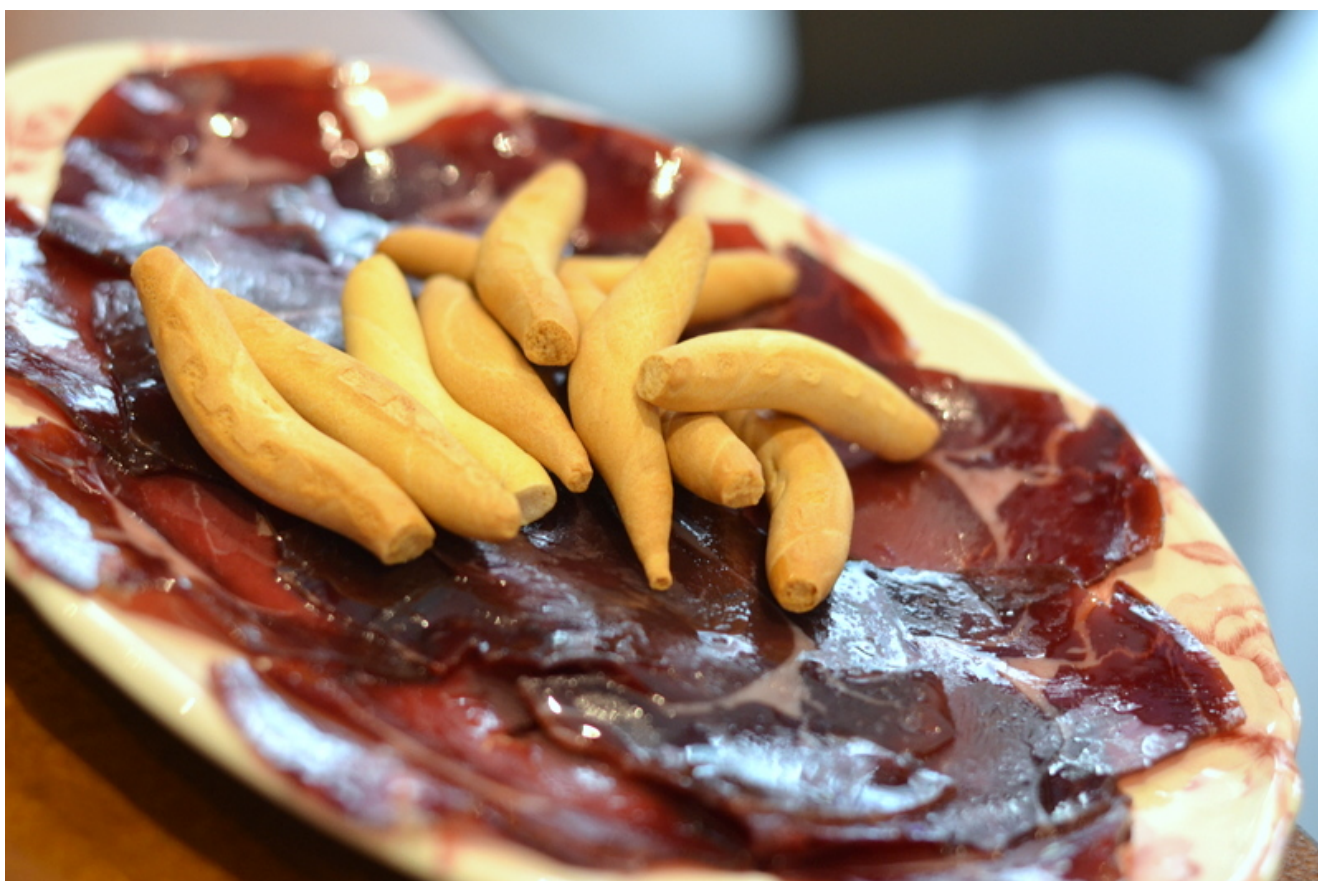
Mouth-wateringly marbled cecina

We chose four small plates to share between the two of us, testing La Falda's version of the Spanish classics of jamón croquettes and cured beef, or cecina , and their ability to fuse Castillian products with Asian flair in their pork spring rolls and octopus sandwich.