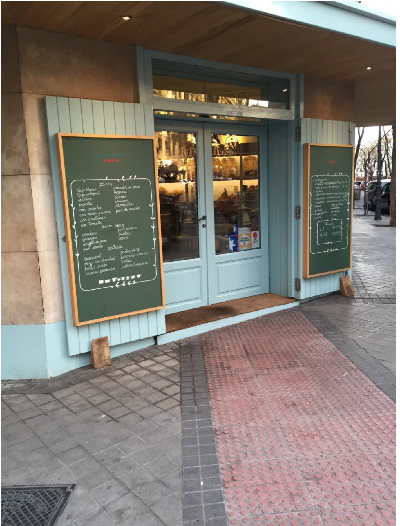
One of the biggest disappointments of having to move after the holidays was not being able to stop there on my daily commute.