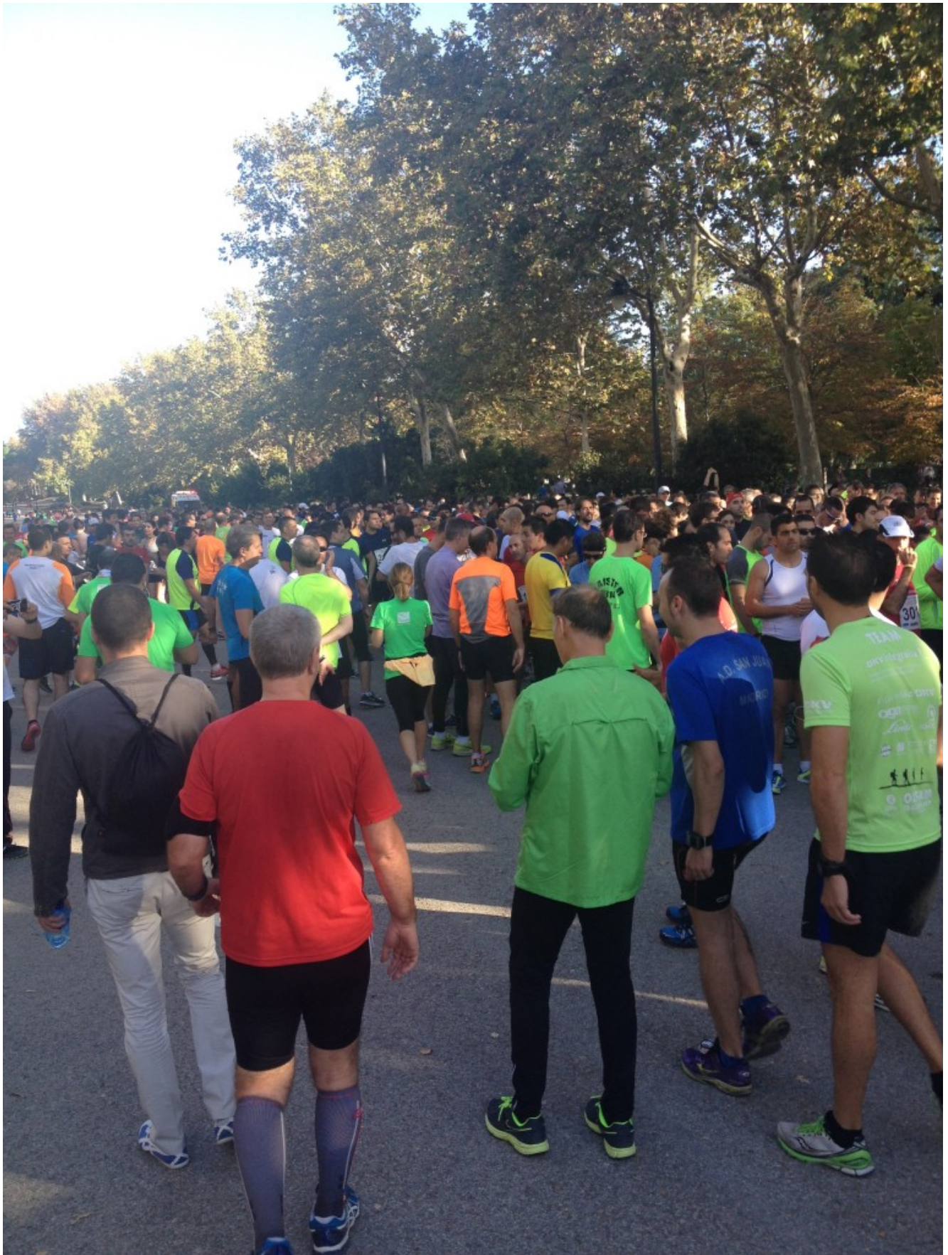
Getting ready to start, check out the lycra ;) )