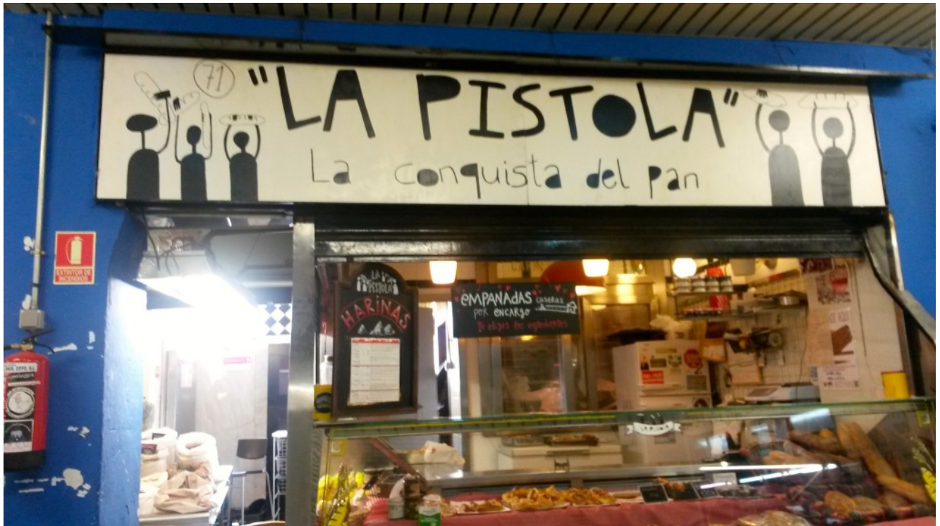
bread and empanadas... mmmm