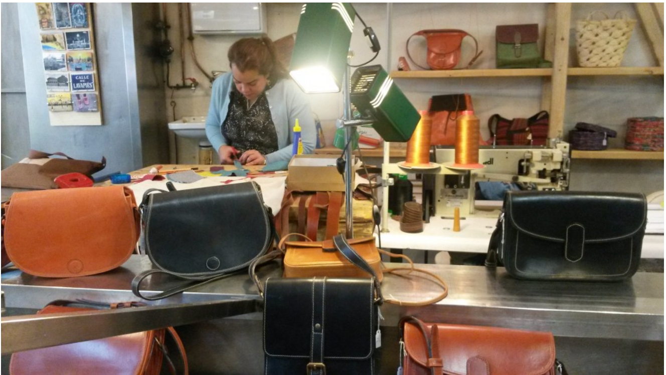
Colorful handmade leather goods

the city's newest nightlife destination , attracting Madrid's trendiest young hipster crowds. Great restaurants and bars, from urban chic to authentic Moroccan, are interspersed within the demographic makeup of the neighborhood. And the prices are still modest in comparison to other hotspots like Malasaña and Chueca.