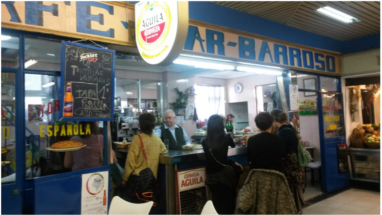
the old-fashioned Bar Barroso isn't going anywhere!