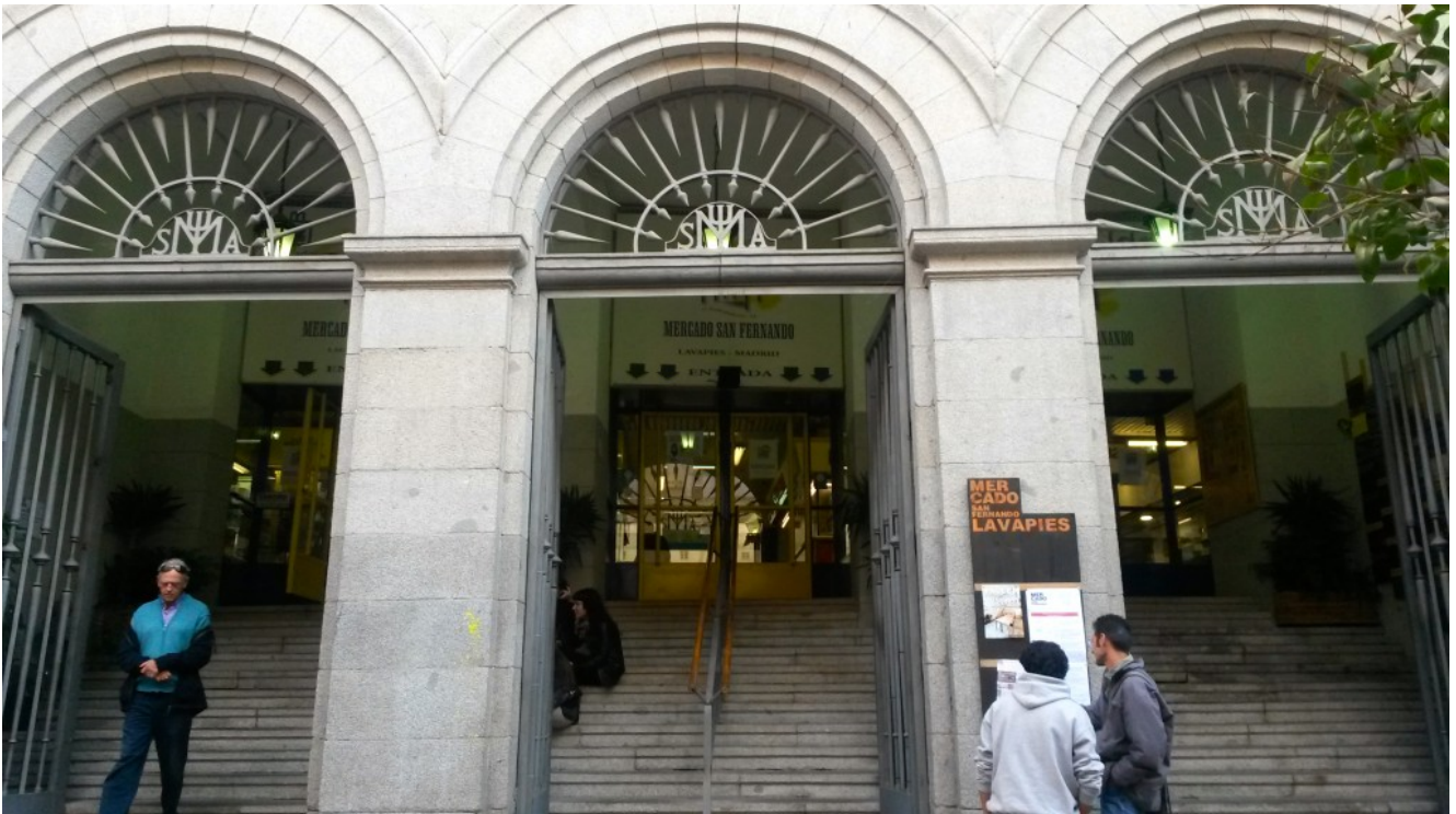
Mercado de San Fernando/Lavapiés' facade on calle Embajadores, 41

Plus, on Sundays they throw different events, such as Swing Dancing and Salsa Lessons (free...)!