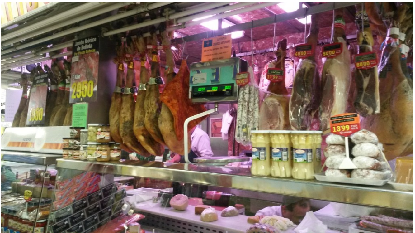
the quintessential Spanish butcher

While I think the monthly Mercado de Motores is Madrid's "coolest" market, Mercado de San Fernando is much different. This one's open every day and it's totally unexpected!