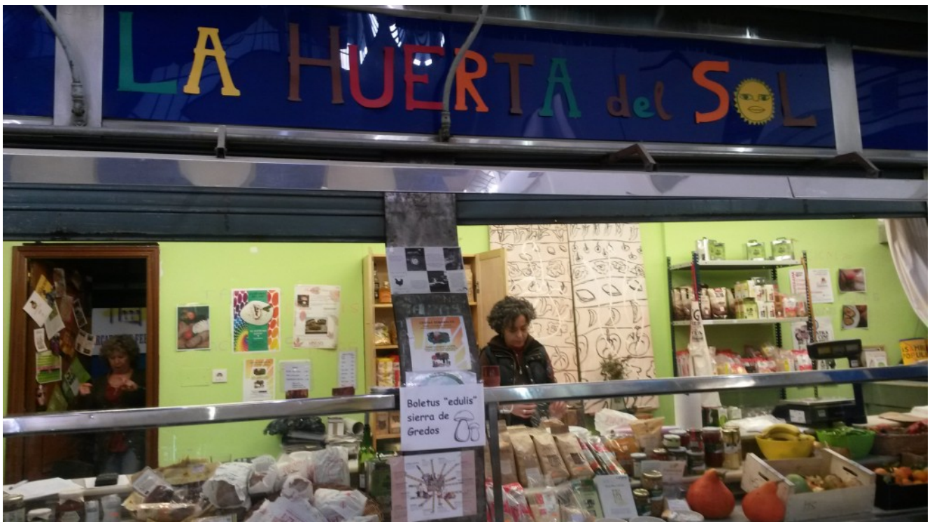
the "ecological" fruit seller

The streets of Lavapiés are lined with Indian restaurants , hipster cafés and independent boutiques, and its market is just as diverse as all the small alleys and plazuelas surrounding it. Here you will find a wonderful mix of