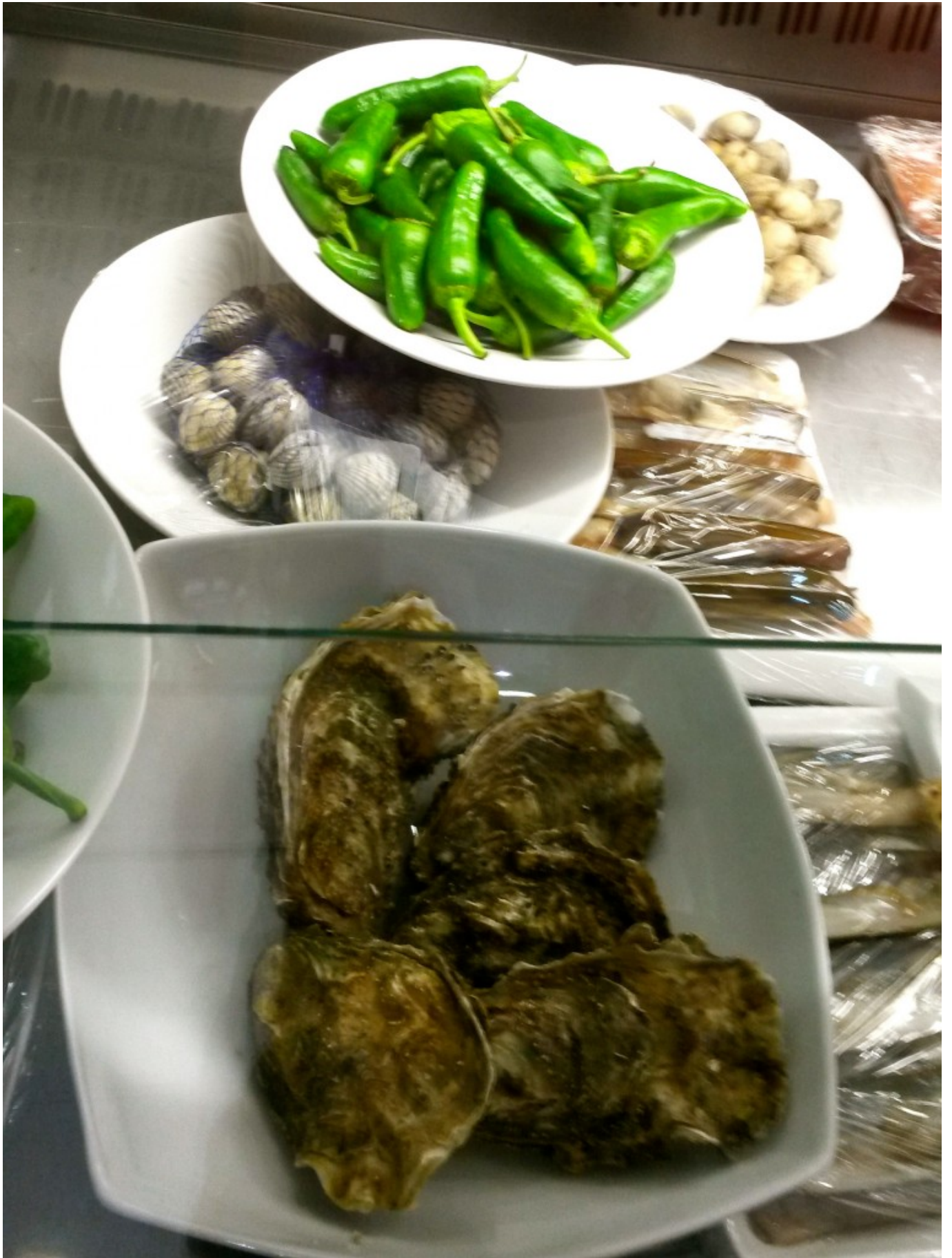
Oysters, clams and pimientos de padron