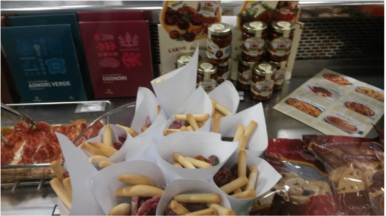
Spanish-style treats and snacks