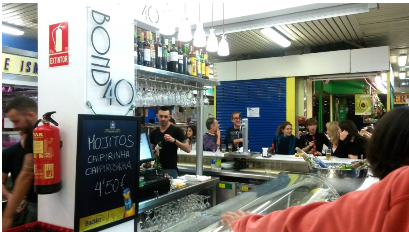
Cocktails and oysters

traditional Spanish shops and foreign options. The fruit-seller and the good old Bar Barroso blend happily together with the higher-end oyster/wine bar, Bond 40, and the stylish leather handbag maker.