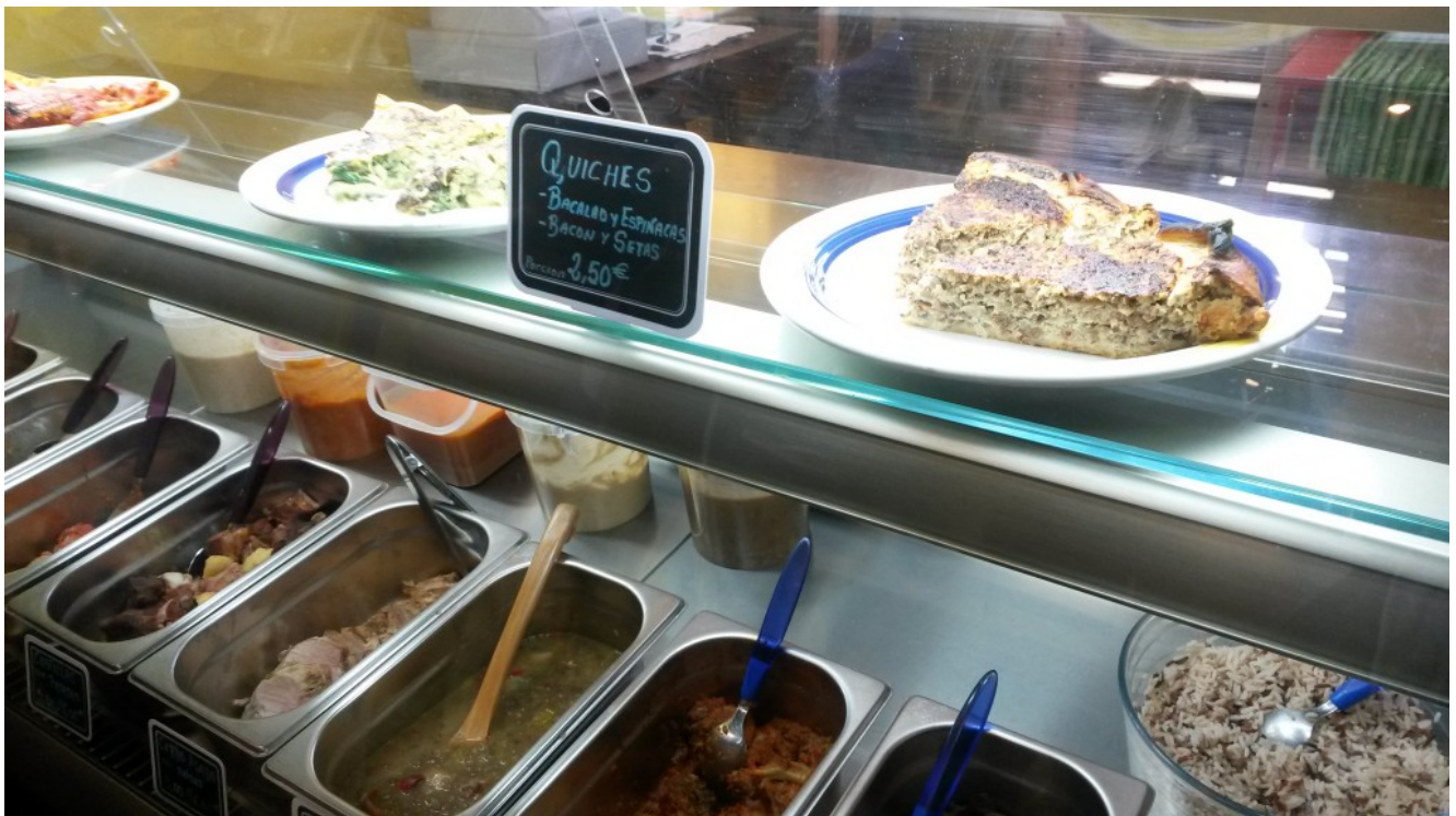
Homemade food from quiche to meatballs

When I first went to Mercado de San Fernando , it was by chance. I was walking up Calle Embajadores and stumbled upon a rather austere building with a grey facade. Little did I know that I was about to slip through the market's winding aisles to discover stands selling quiches and empanadas, as well as full bars crowded with patrons from all walks of life—families with children, the older generation, groups of hipsters, foreigners and locals alike.