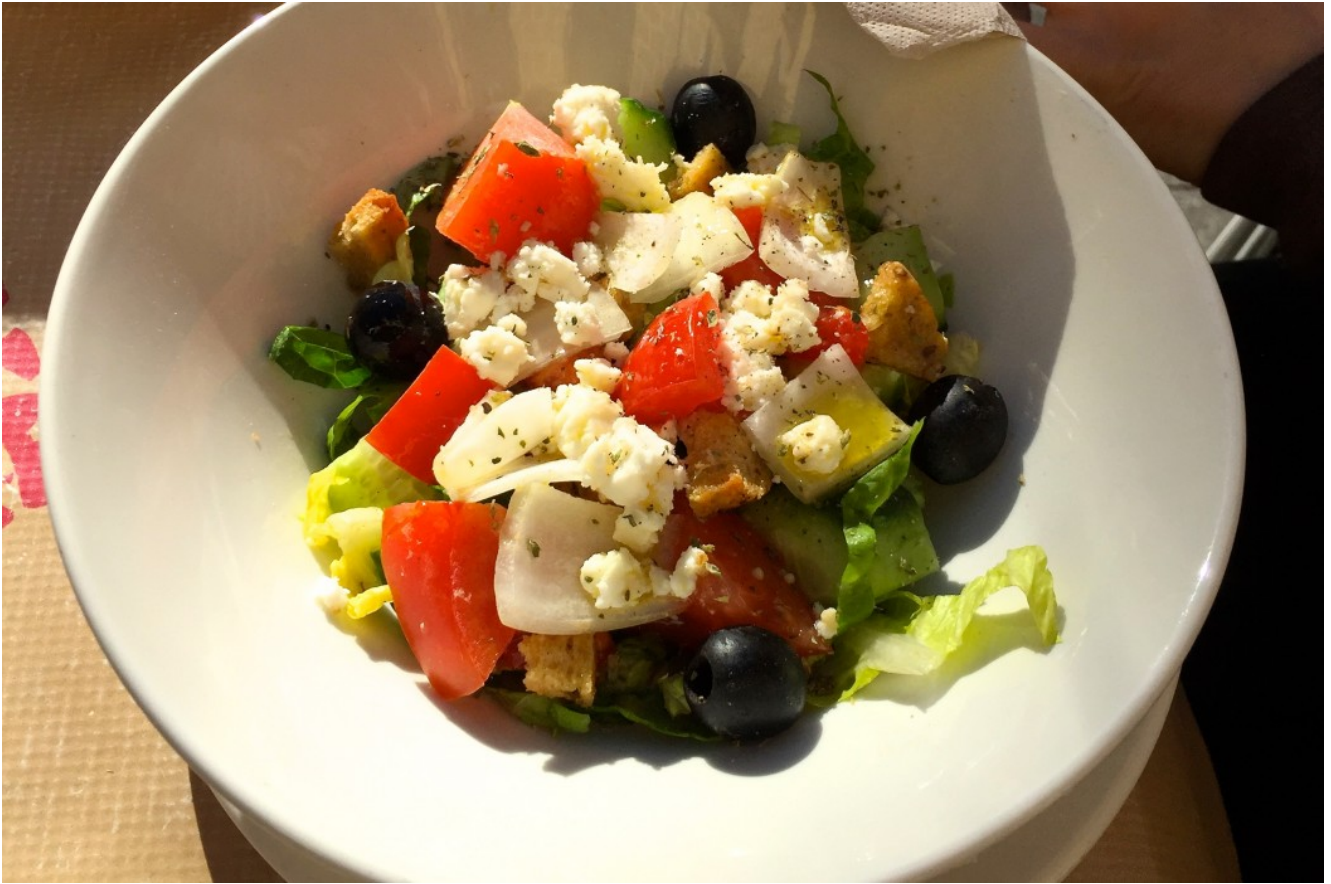
Greek salad starter at La Mucca, Malasaña