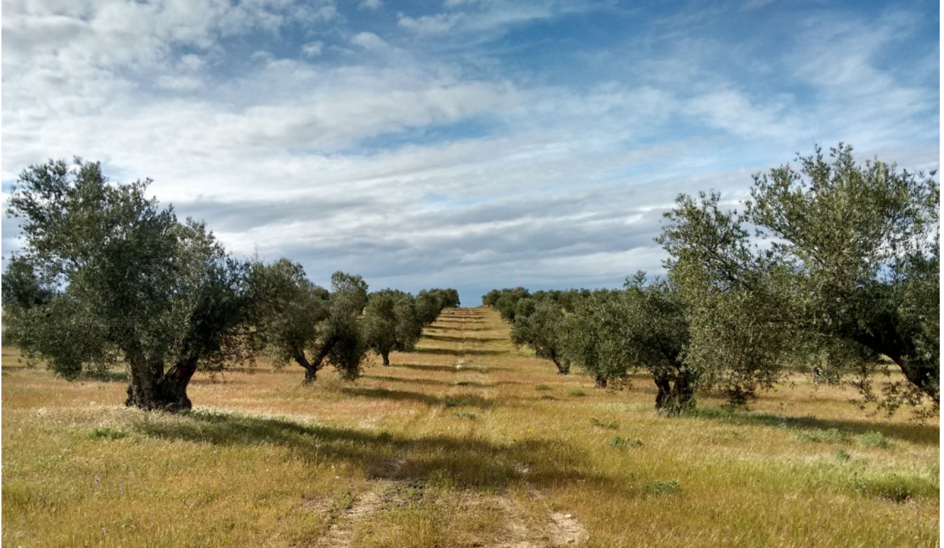
The centenarian olive trees

hard fruit, ready for the annual harvest of some of the tastiest organic extra virgin olive oil in Spain.