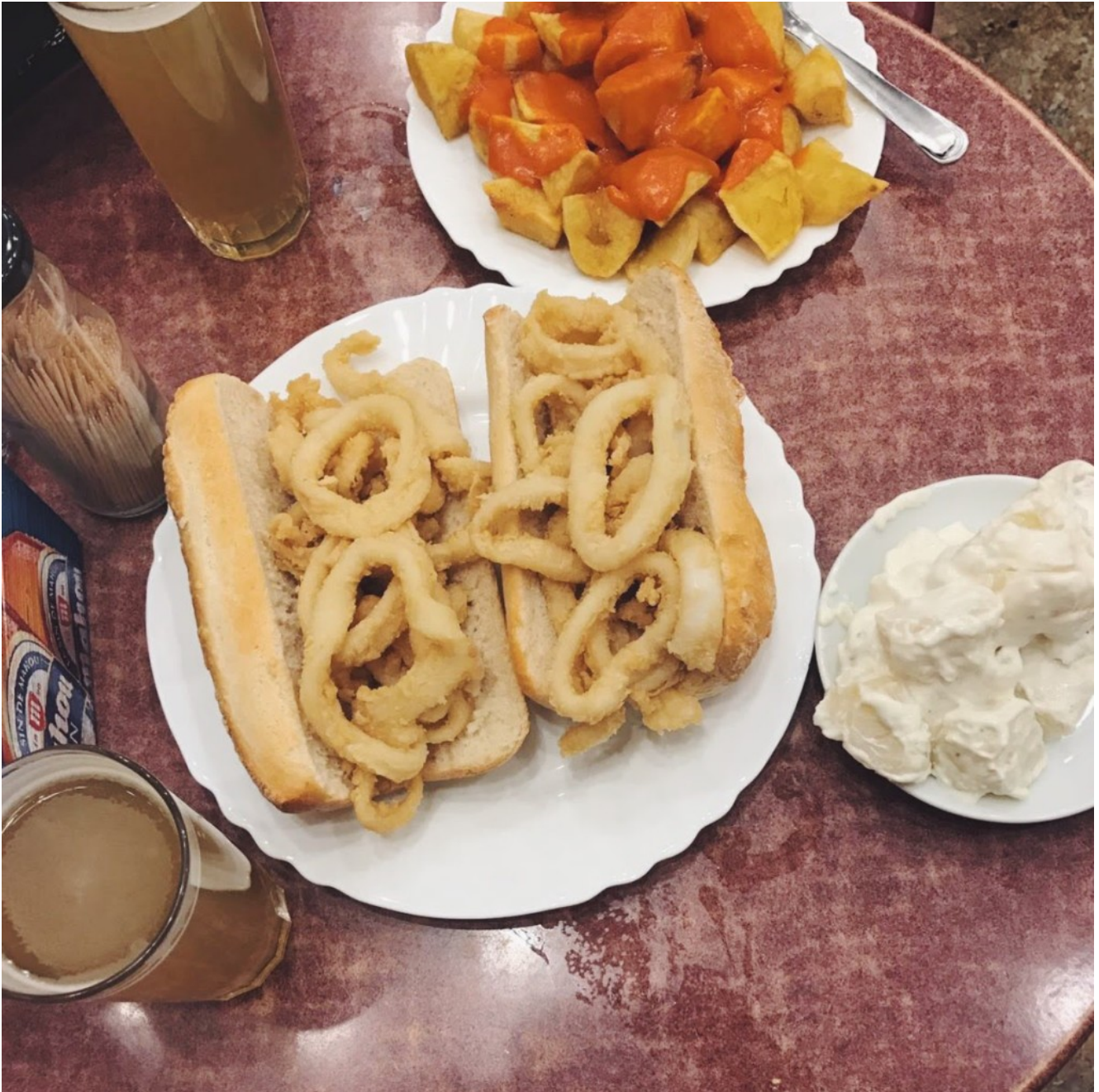
Bocadillos de calamares con patatas bravas y patatas alioli