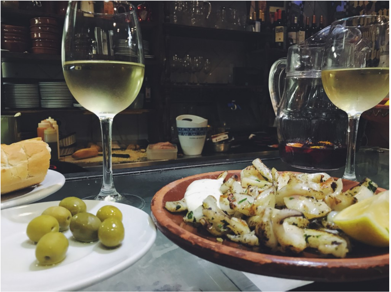
Sepia con vino Madrileño