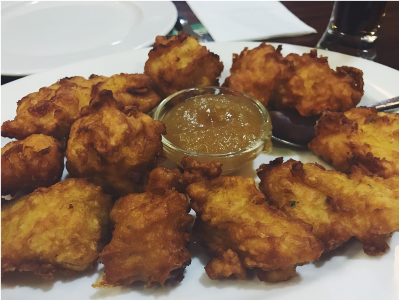
Delicias de bacalao con mermelada de madroño