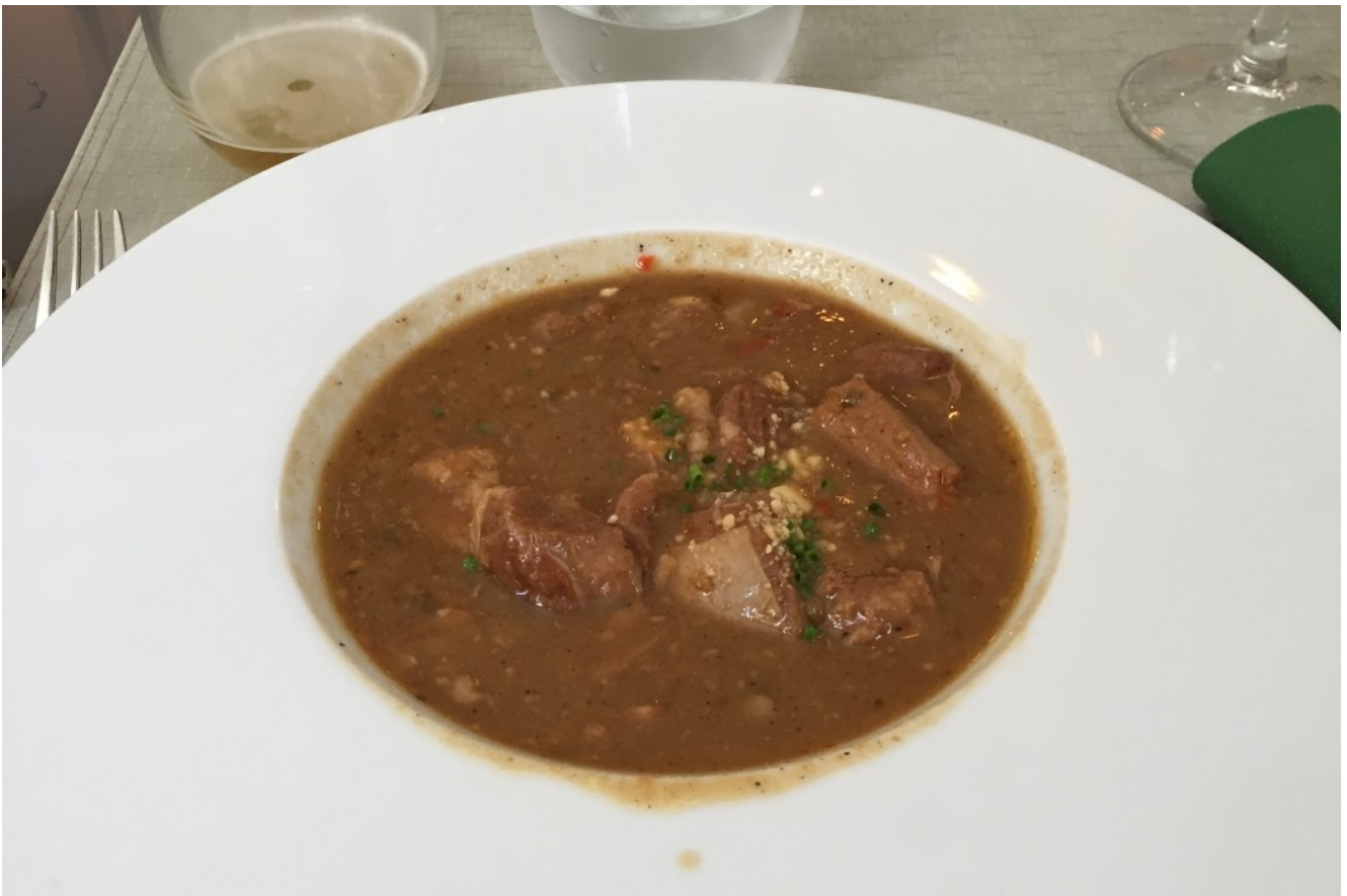
Stew as the main course at Bacira