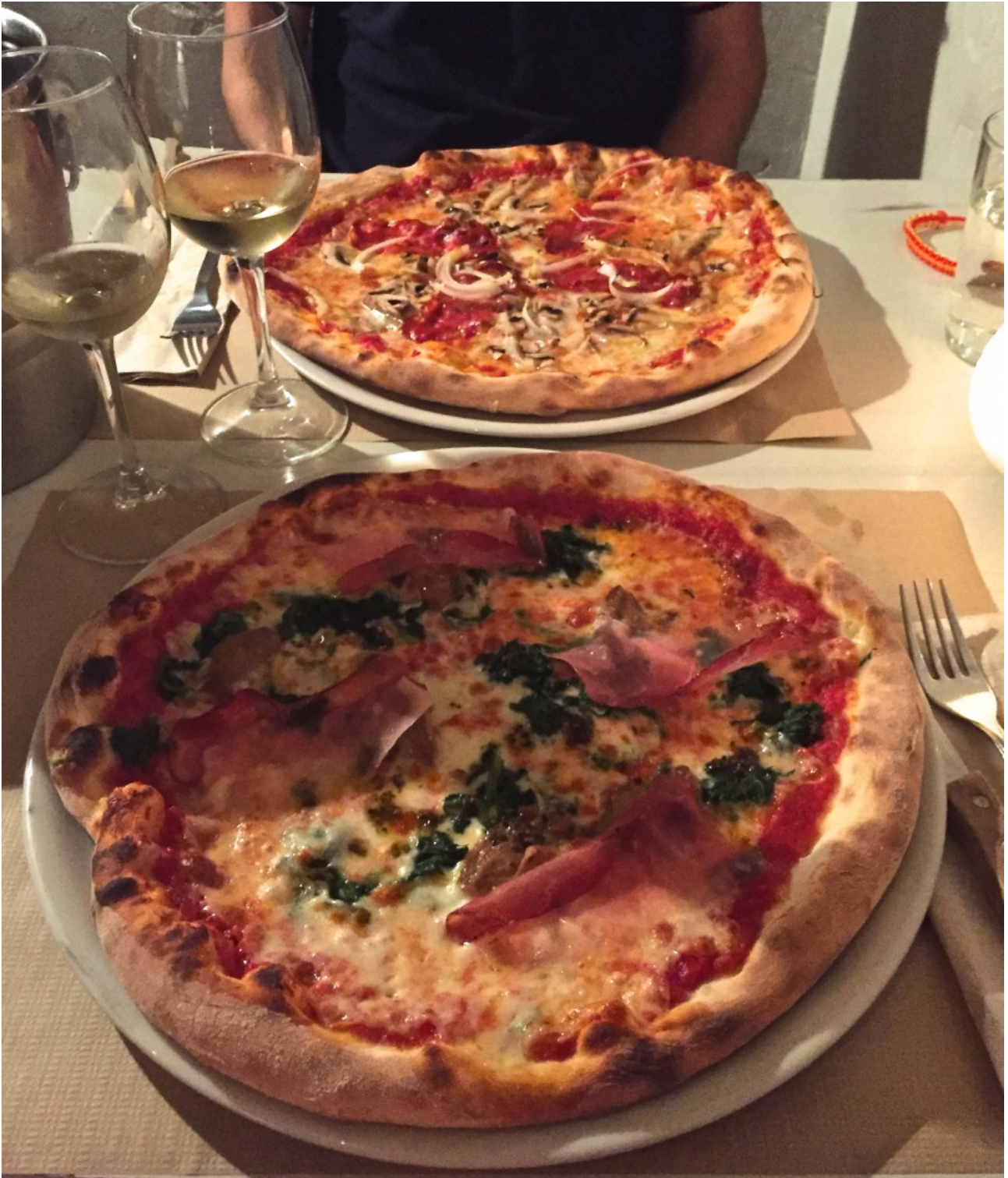
Casa dei Pazza

Just to switch things up here, let's focus on quantity. Casa dei Pazzi offers a substantial salad as a starter and then a whole Italian-style pizza for your main course. There's also wine, bread and dessert. You'll wonder how you got away with paying only 11 euros, half-expecting to look over your shoulder as you leave and see an angry Italian chef charging