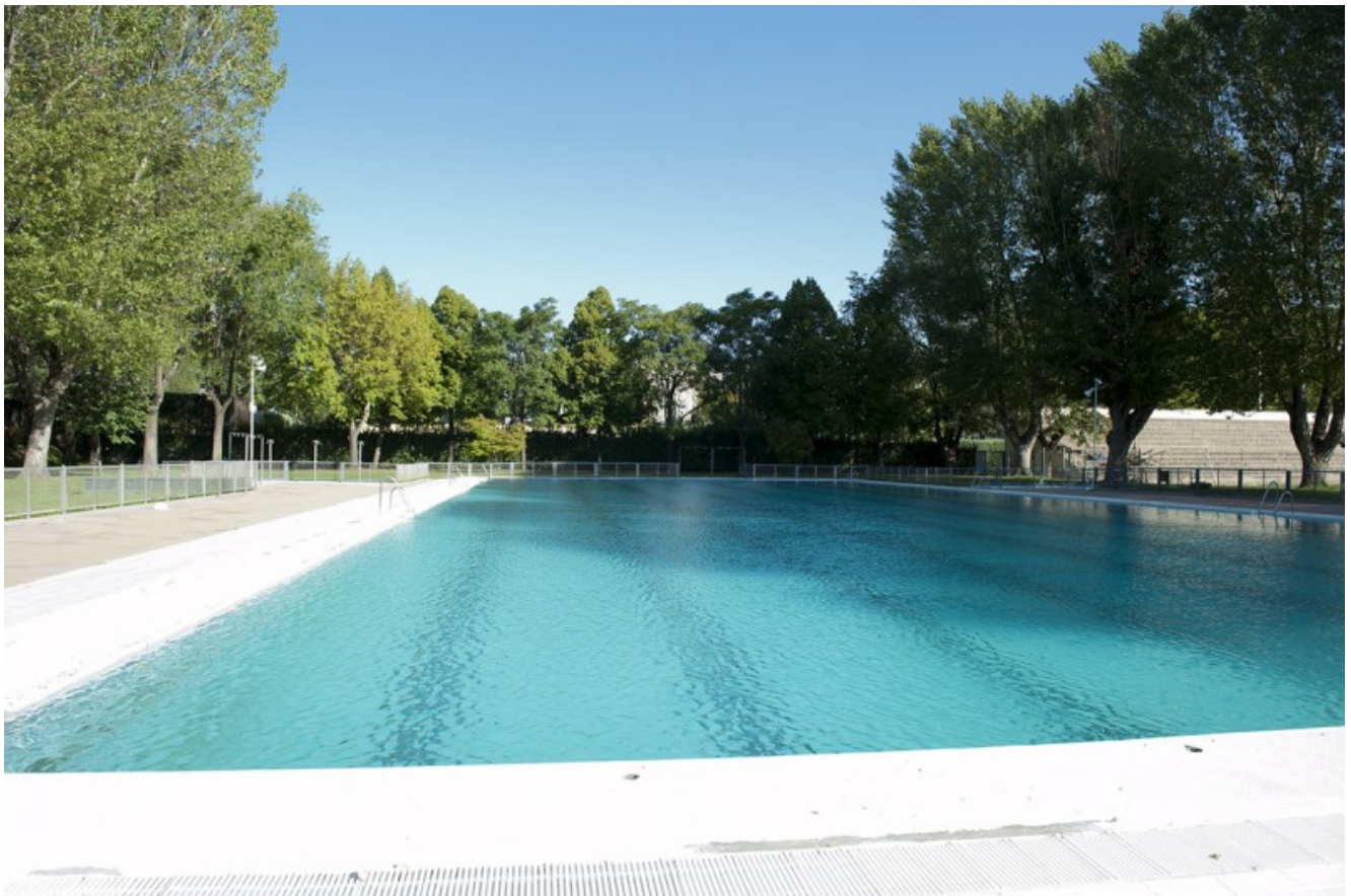
Summer pool by UCM

You also have the largest water park in Europe about 15 minutes from Madrid in Villanueva de la Cañada. Aquópolis can get very packed during the peak season so you may be better off going to one of Madrid's outdoor pools on hot summer weekends.