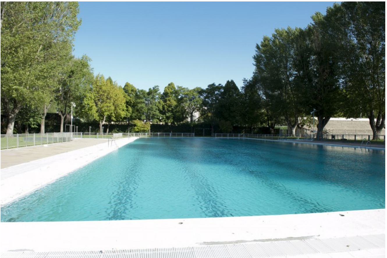
Summer pool

You also have the largest water park in Europe about 15 minutes from Madrid in Villanueva de la Cañada. Aquópolis can get very packed during the peak season so you may be better off going to one of Madrid's outdoor pools on hot summer weekends.