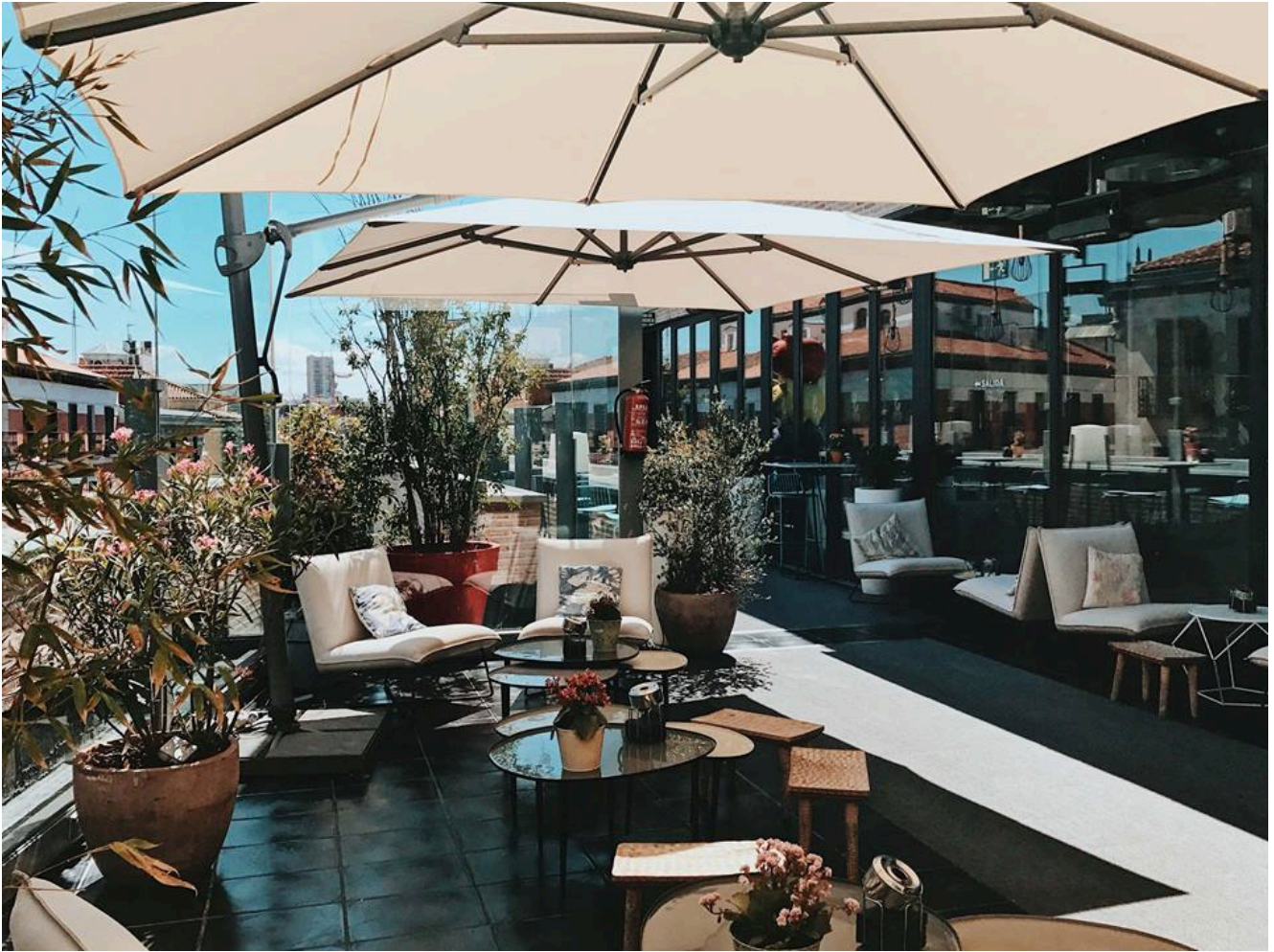
Photo from Mercado de San Antón

This is a perfect place to start your evening with friends. As you enter Chueca's beloved food market, Mercado de San Antón, first you'll walk through various food stalls and tapas stands. Then make your way up to the fourth floor for a drink any time of day, any time of year.