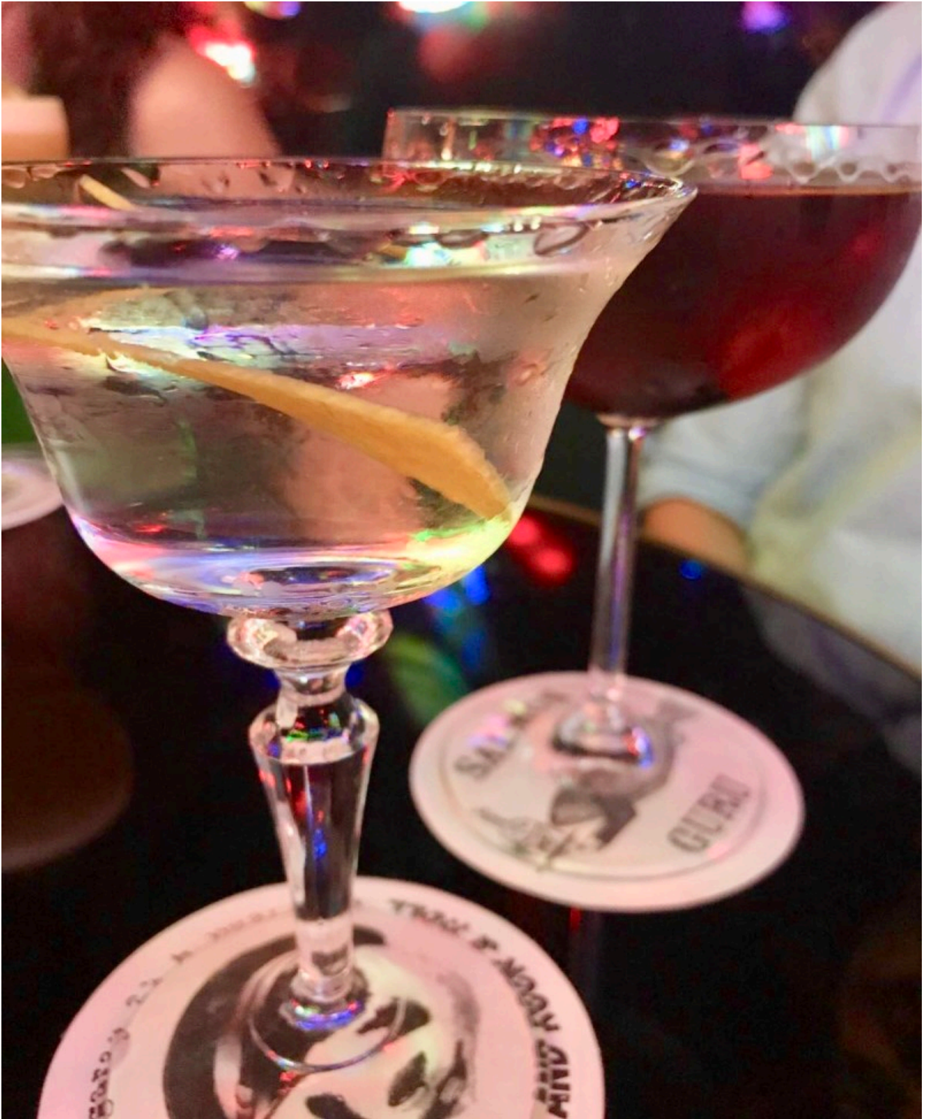
Vesper Martini & classic Manhattan

Need one more reason to check out Salmon Guru? The place is a must for whiskey lovers. If you don't see your favorite amongst the extensive selection of American bourbon and rye on the shelves, ask to see their secret whiskey menu.