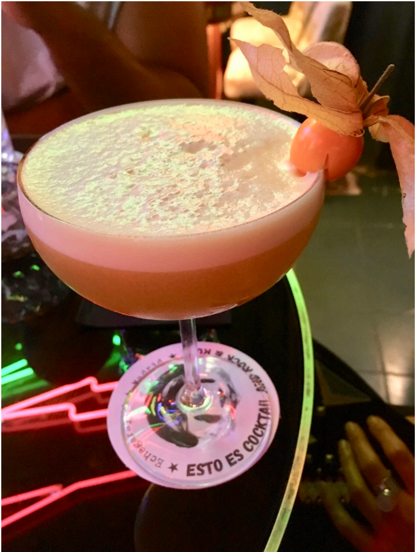
Pasión, a blend of rum, coconut milk and passion fruit