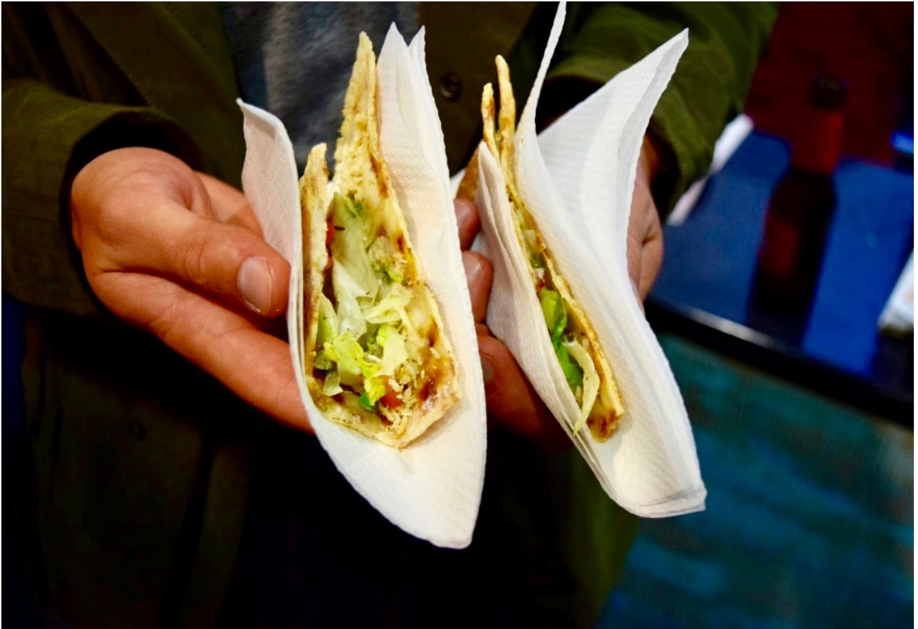
The delicious “Crepioca” tapa from Saboor Tapioca

In other words, this festival is every adventurous foodie’s dream come true. There are various strategies for tackling the overwhelming amount of options ( 122 tapas in total ) and chaotic crowds. You can simply wander around, dropping into whatever bars you come across and trying your luck. Each one usually advertises a photograph of their tapa with a huge poster out front, so you’ll know more or less what to expect. Don’t forget to stop by Mercado de San Fernando and Mercado Antón Martín, where several vendors also participate.