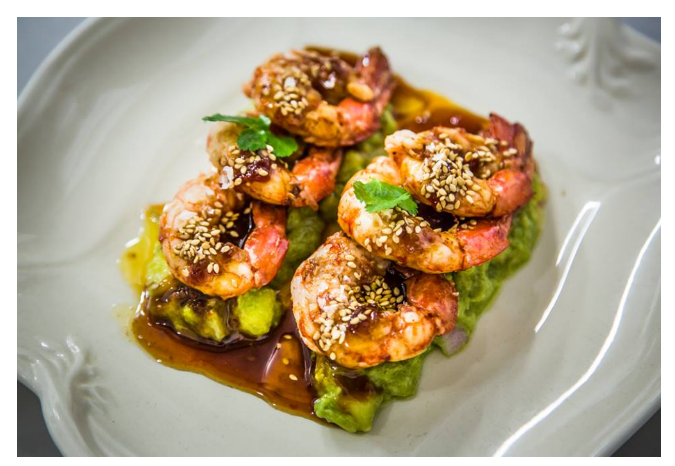
Gambones a la brasa — grilled shrimp

I was warned by the hip (but not scarily so staff) that if you want a table on a Saturday night you need to be booking up about a week in advance. My concern is that after a rave review that might up the ante to a fortnight. Either way, Lady Madonna is the kind of place that cocoons you with its culinary chicness but has you pining for your Oysho jammies by the time you pay the bill (or maybe that's just me/an attack of my eyes being bigger than my belly!).