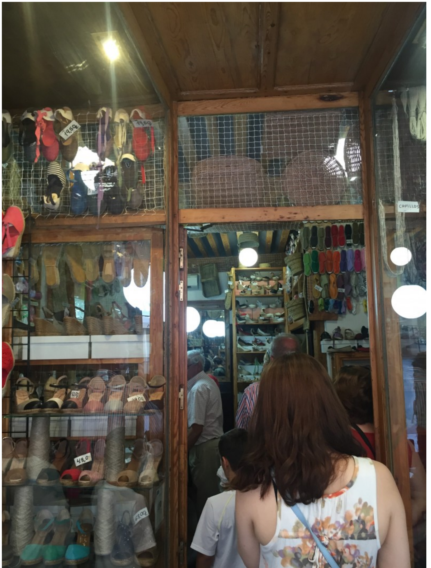
Casa Hernanz Calle de Toledo, 18