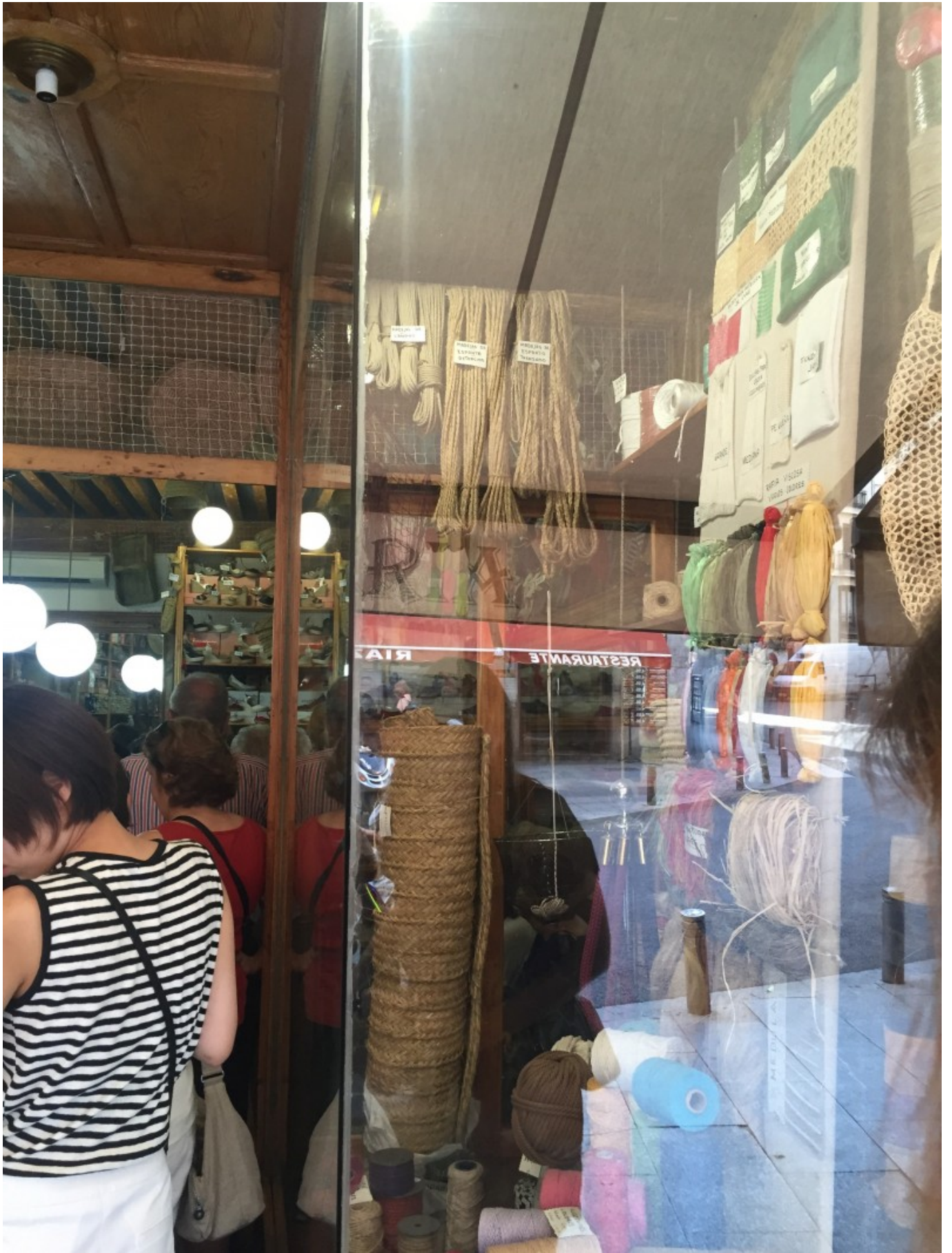
Founded in 1840, and in the fourth generation, you'll find the wide selection of threads and fabrics the family produces. And