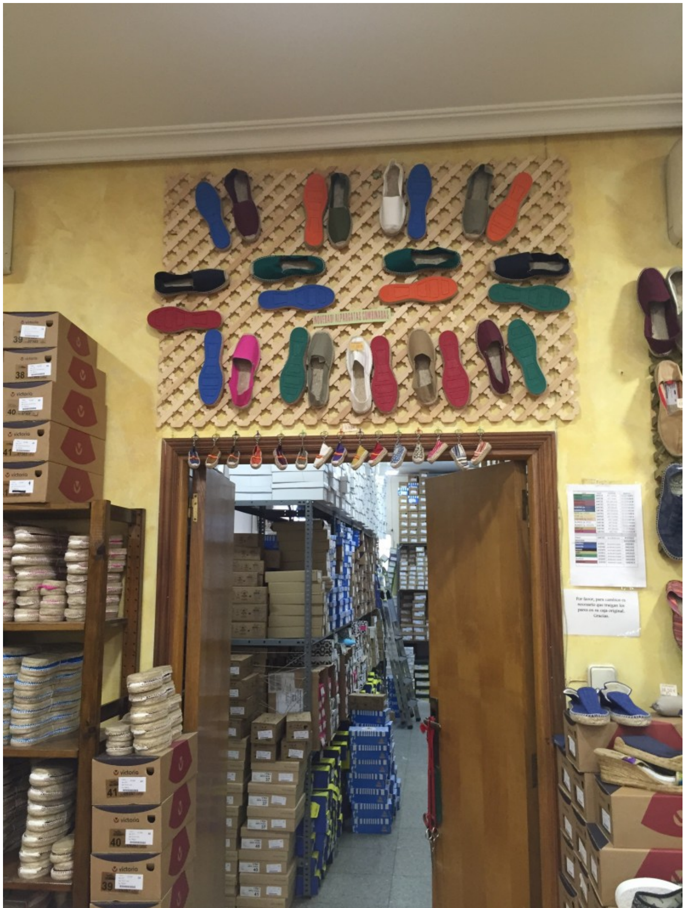
They even have new models, which you can see in the picture above, that have a rubber sole as opposed to the traditional