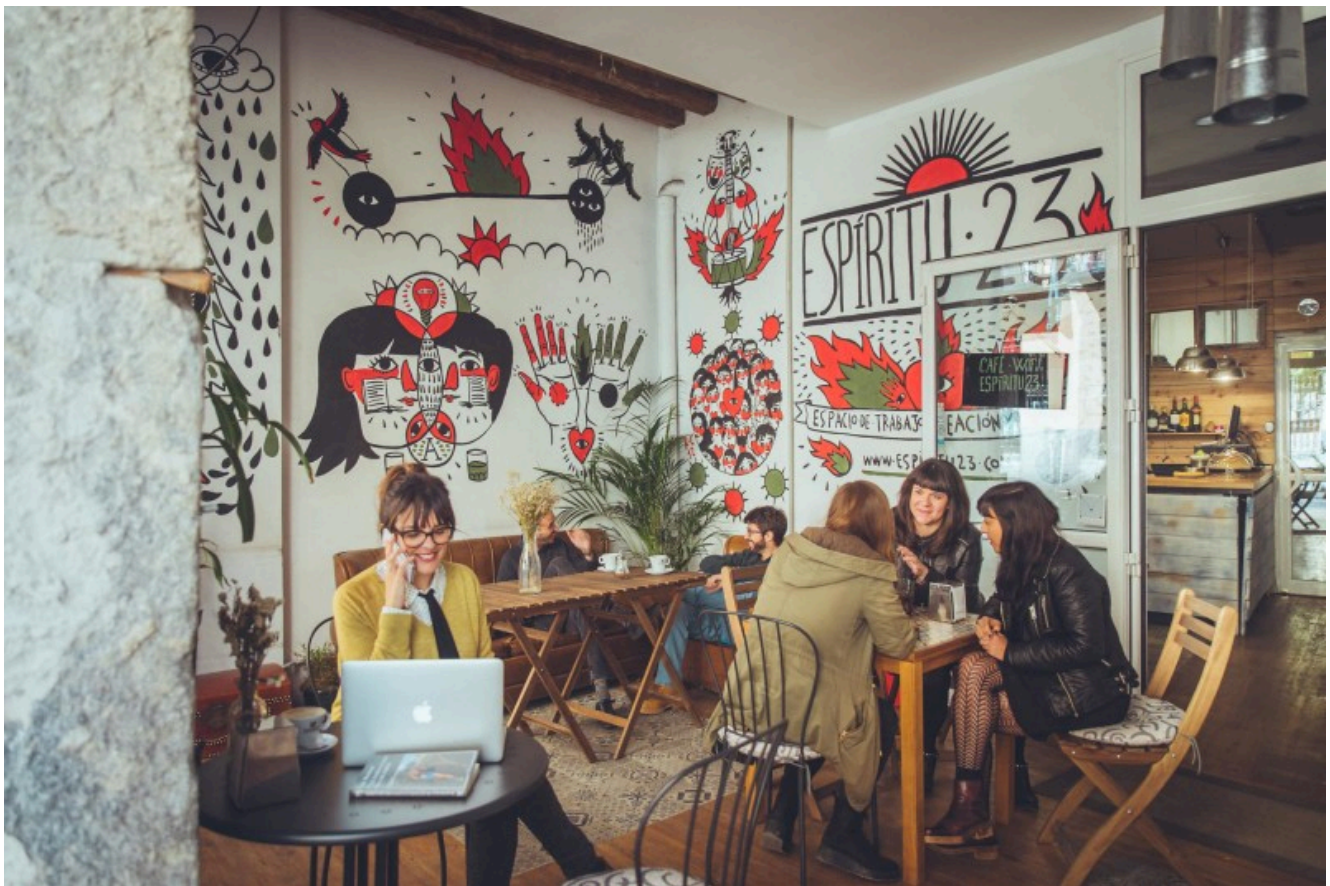
Image from Espíritu 23