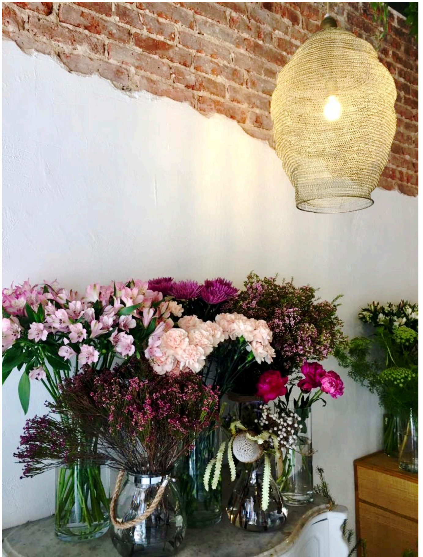
In a city which is often lacking in much other than fairly insipid-looking florals, Botanyco is a haven for flower fans