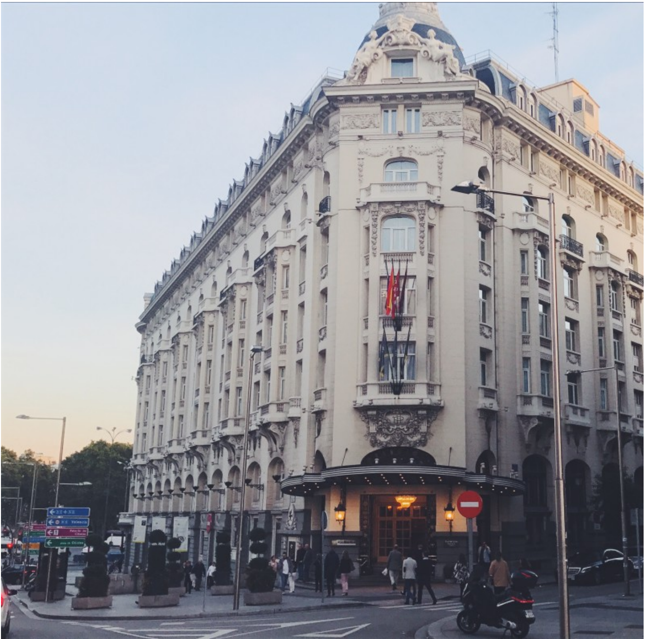
Westin Palace Hotel

Located inside the Westin Palace Hotel is the perfect bar if you're in the mood for an elegant night out. Rumor has it that this high-end bar has had a fair number of influential guests such as Pablo Picasso, Salvador Dalí, and Ernest Hemingway.