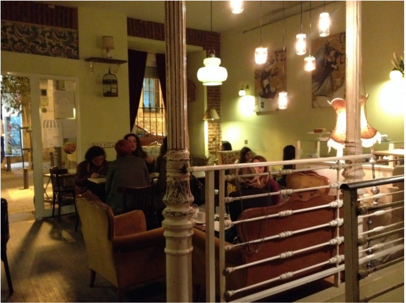
funky furniture at La Paca