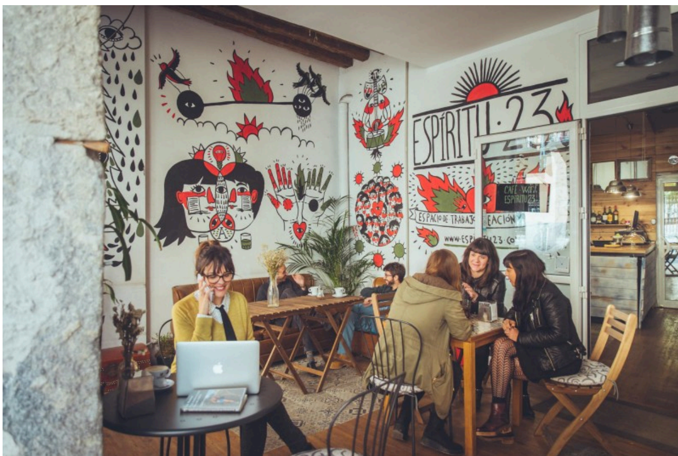
Image from Espiritu 23