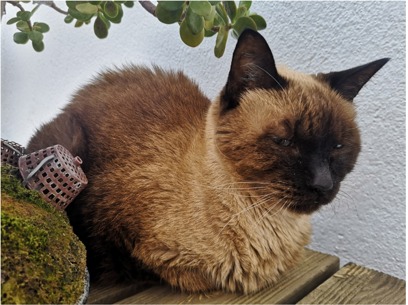
So sleepy, so zen.