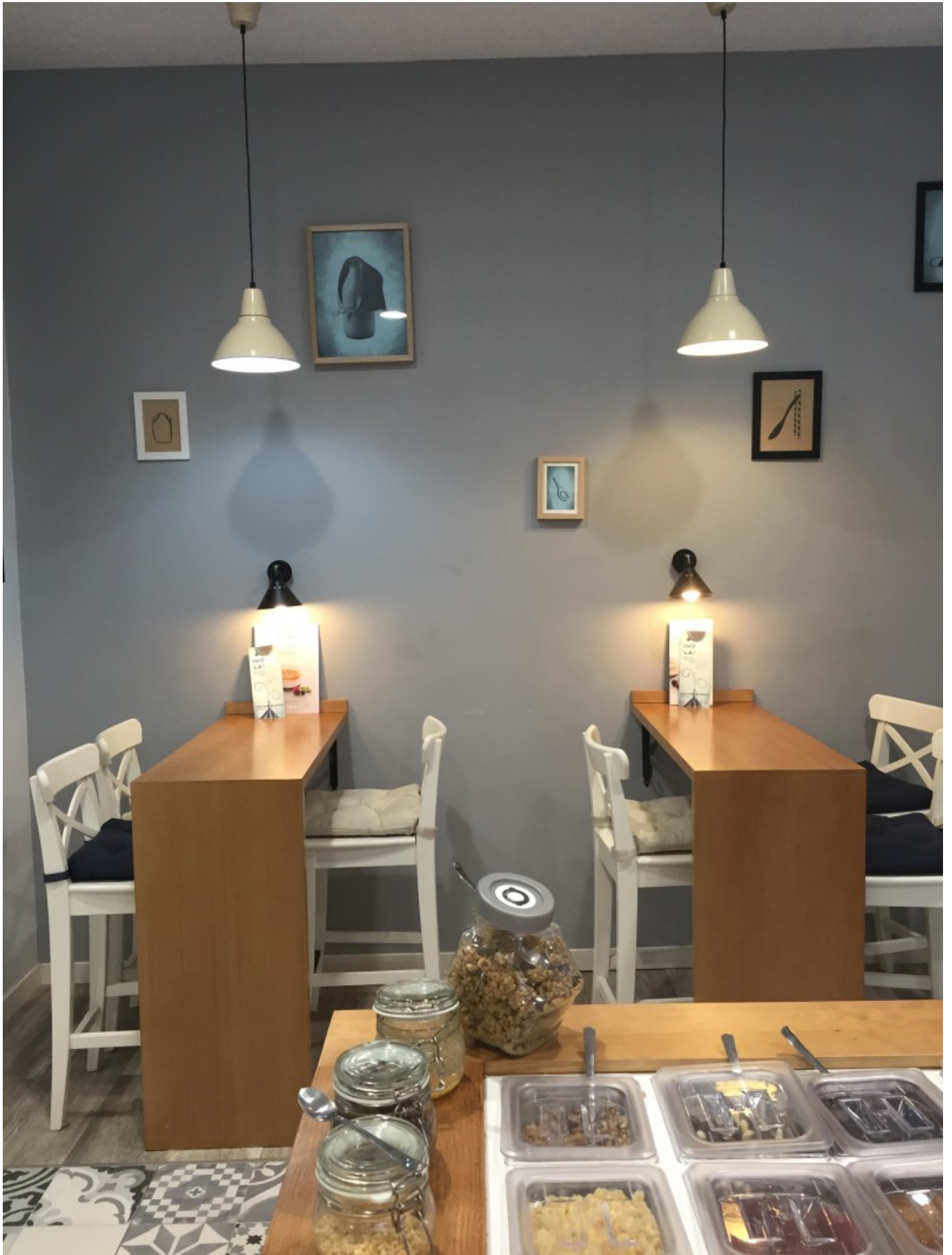
Cántaro Blanco stocks fresh milks, cheeses, yogurts, and milk-based desserts. Its main supplier, according to the EL