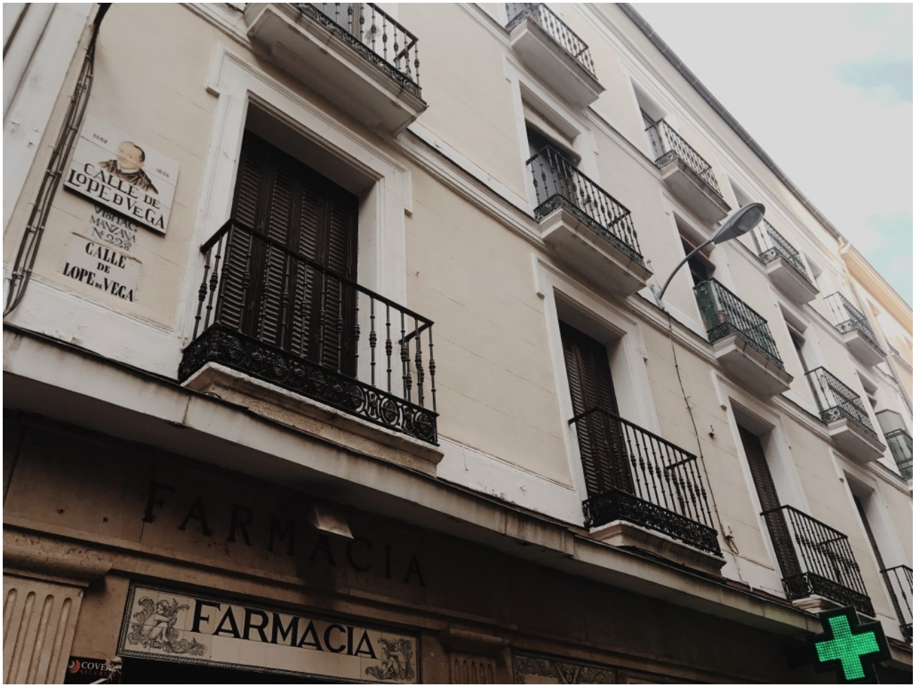
Calle Lope de Vega

Nowadays, this historic neighborhood has become a trendy spot for people to get together and have a drink paired with a few tapas. Calle de las Huertas is the main street where you can easily find great shops, cafes, and some of Madrid's finest eateries.