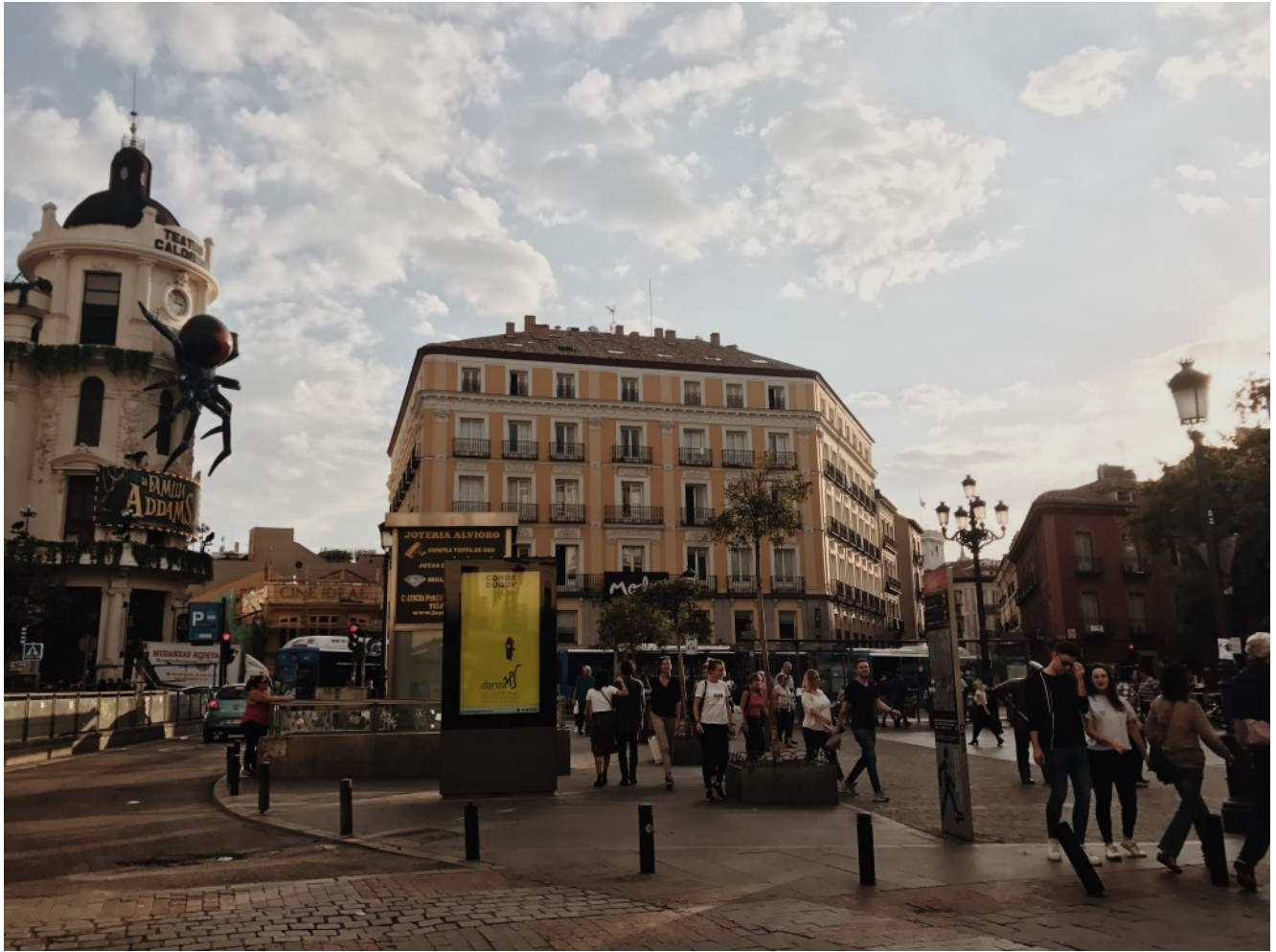
Plaza Jacinto Benavente