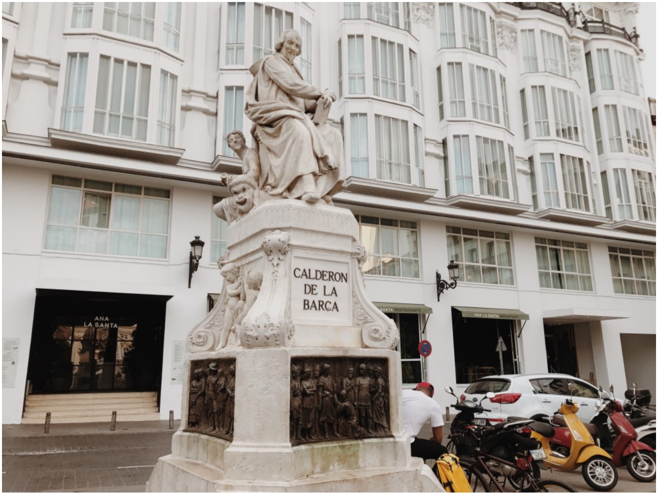
Monument Calderon de La Barca