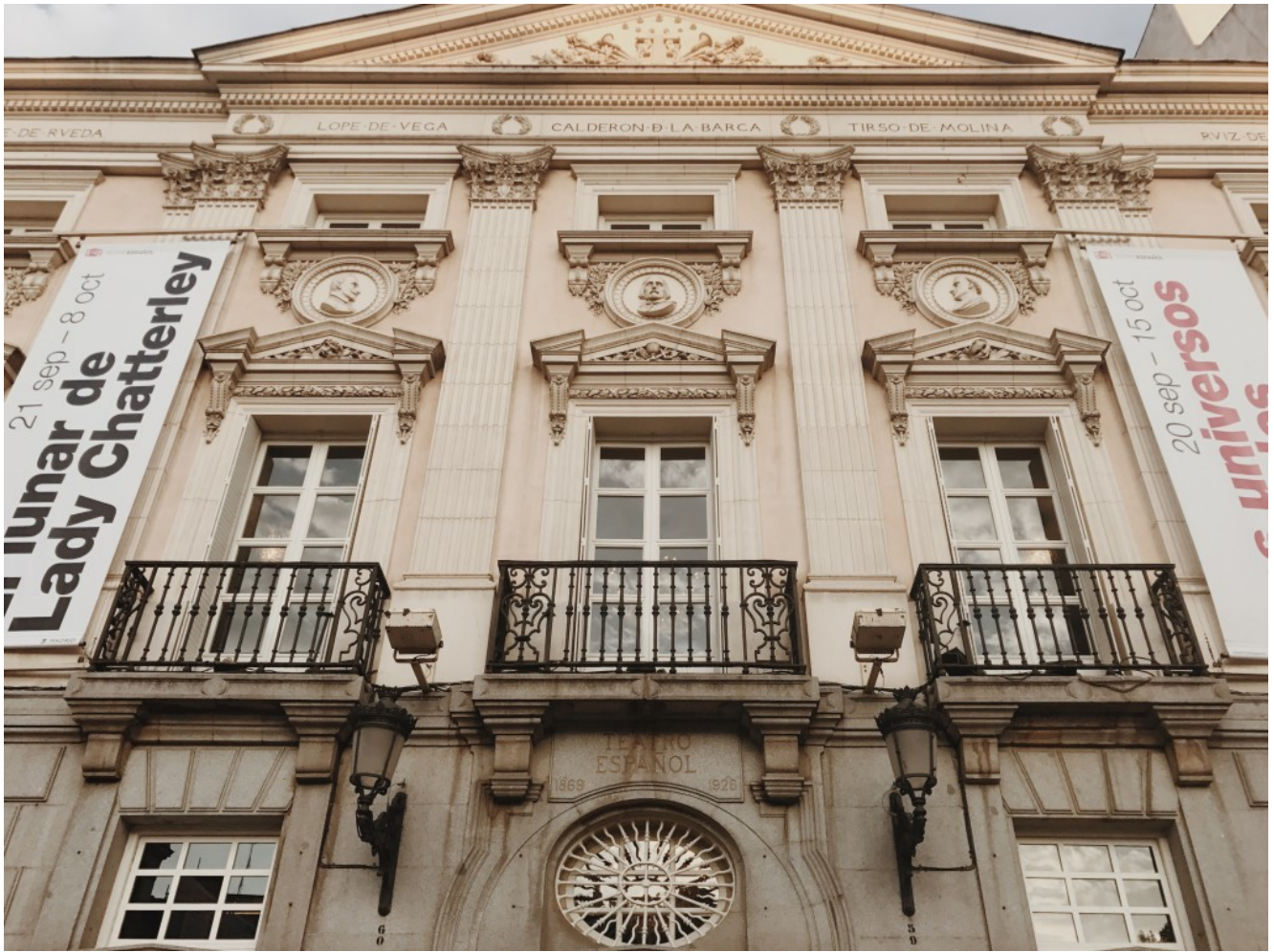
Teatro Español—Madrid's oldest theater