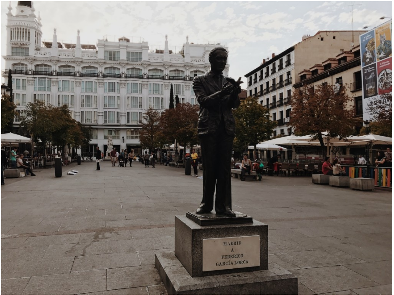
Monument Federico Garcia Lorca