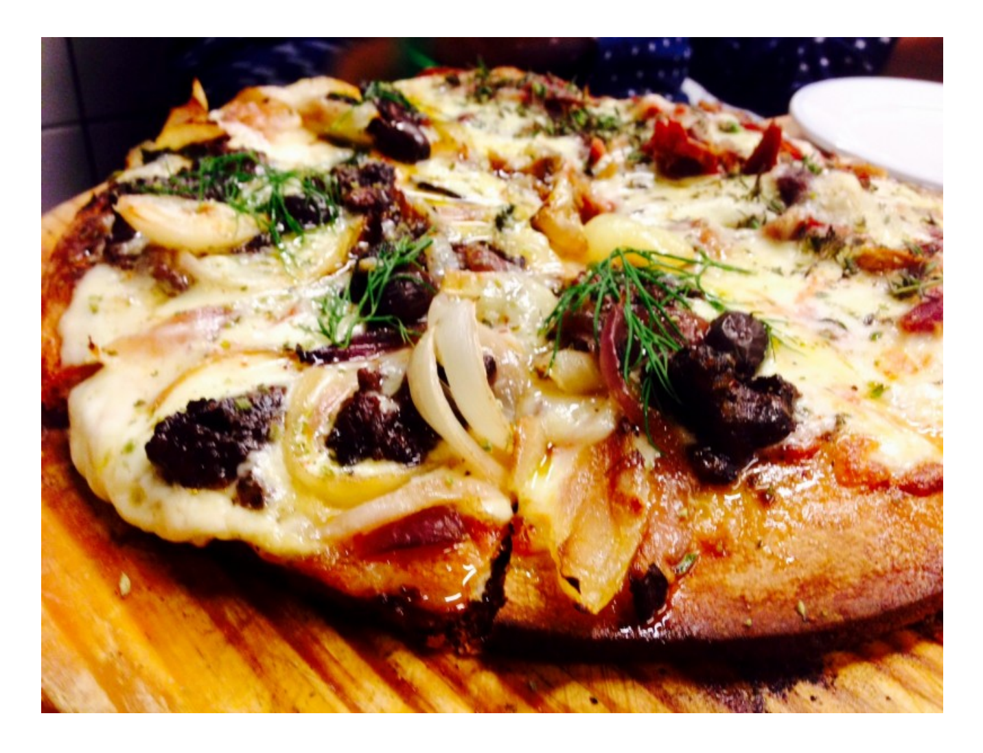
knew we'd have to go back to try the rest!