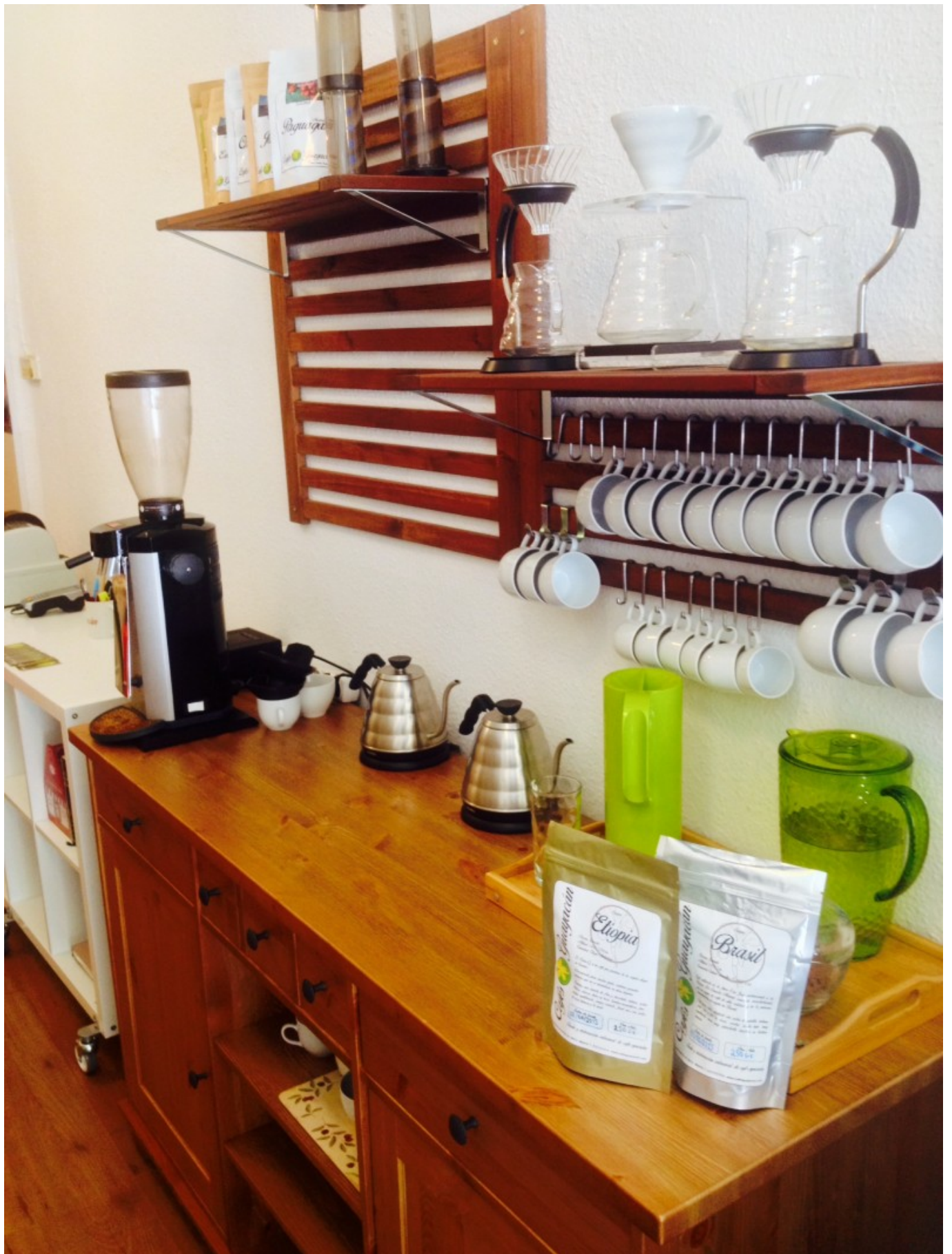
Boasting a wide range of single origin coffee in 125 and 250 gram take home packs Guayacán grinds your beans according to