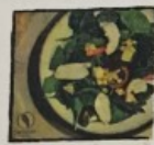
Ensalada = 7,90€