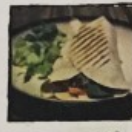
Wrap = 7,90€