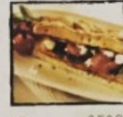
Focaccia = 6,50€