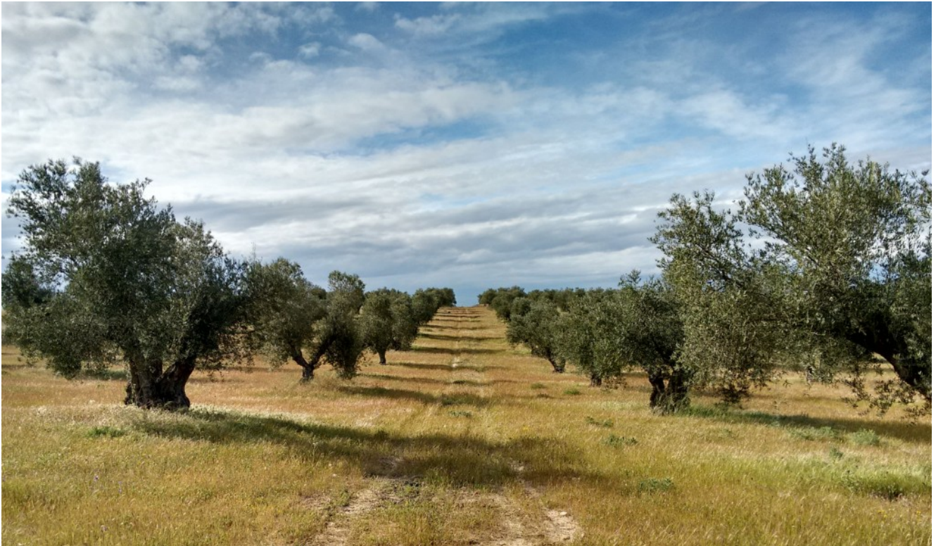
The centenarian olive trees