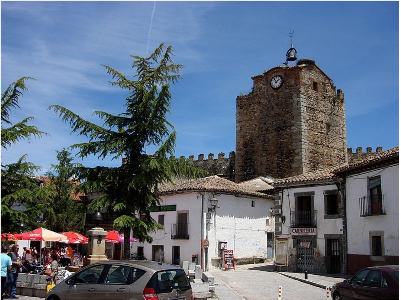
Buitrago de Lozoya by Lugaresconhistoria