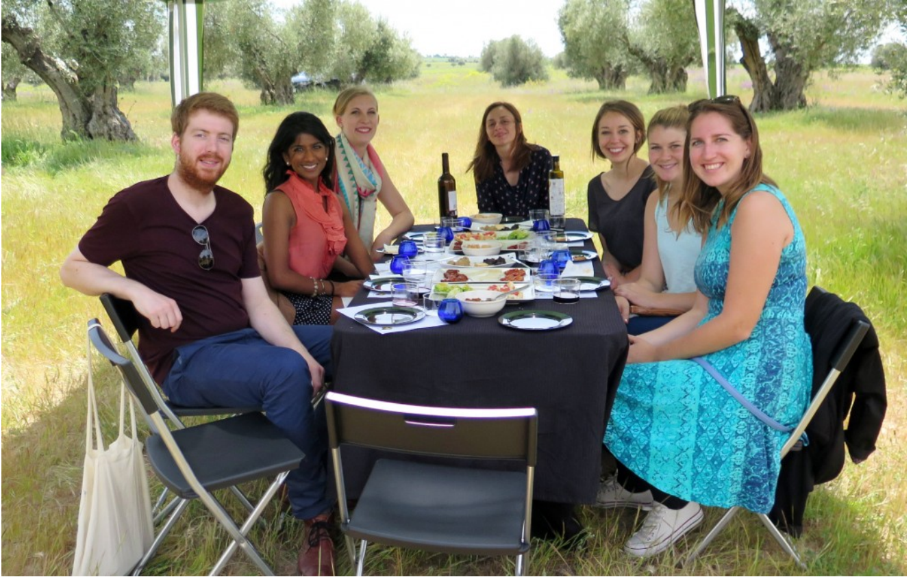
The tasting (and eating and drinking)

a top-up of wine to accompany our final wander through the trees (and take a few grove-selfies). Finally, we had the opportunity to buy some of the delicious products we tasted that day.