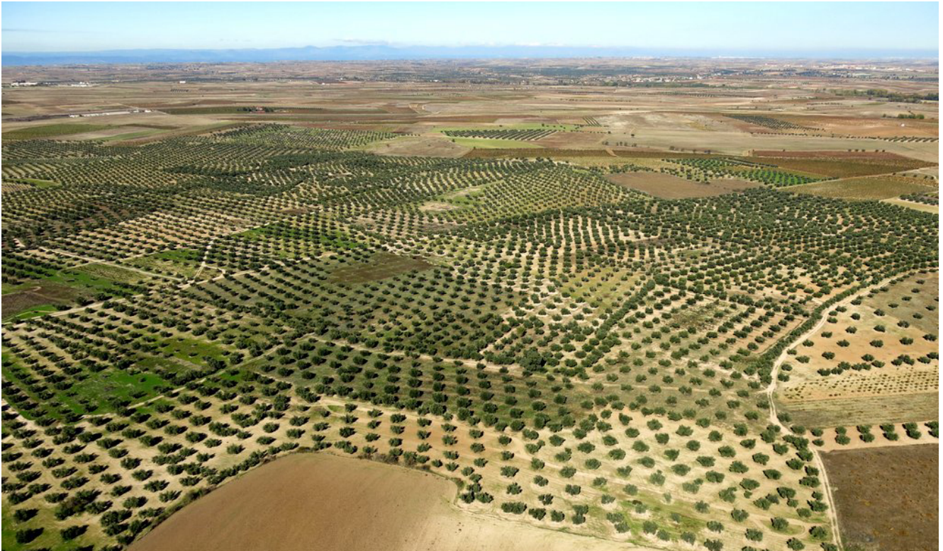
Los Aires olive groves