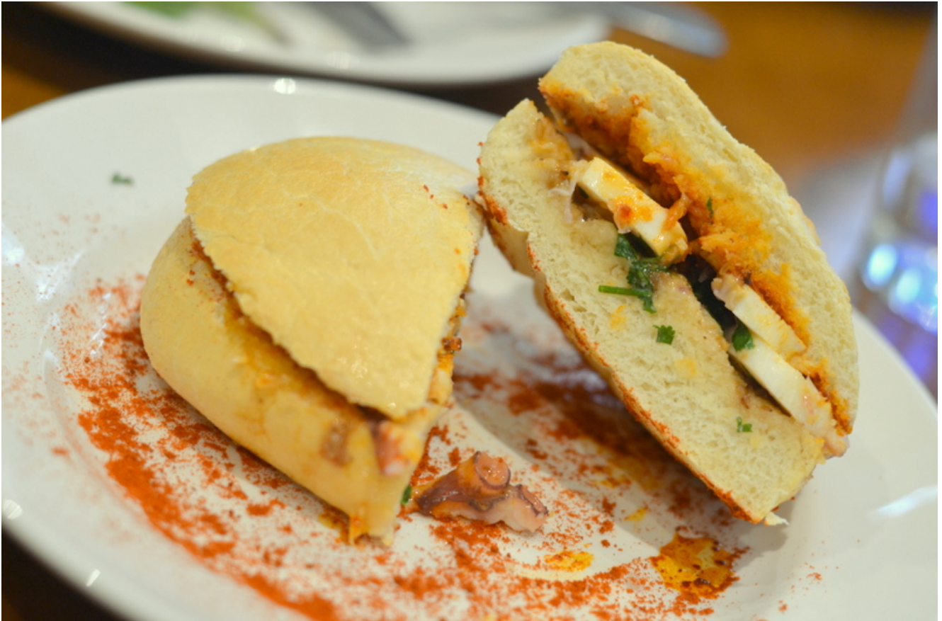
Thai-style octopus sandwich

The cecina was some of the best I've tried in Madrid, and I consider myself something of a cured beef expert, ordering it any time I spot it on a menu. While all of the flavors were impeccable, the winner had to be the octopus sandwich with its mixture of Thai herbs and Spanish paprika.