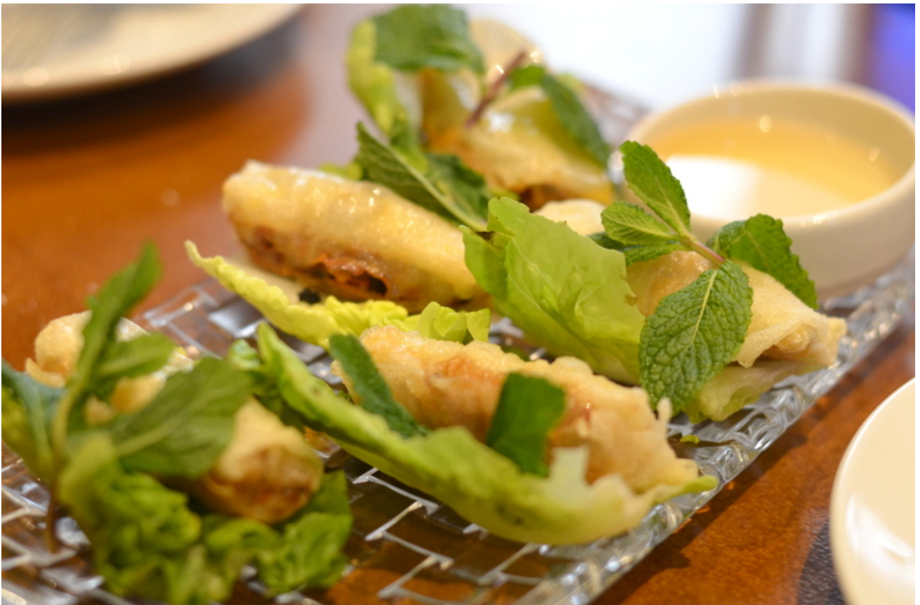
Vietnamese pork spring rolls