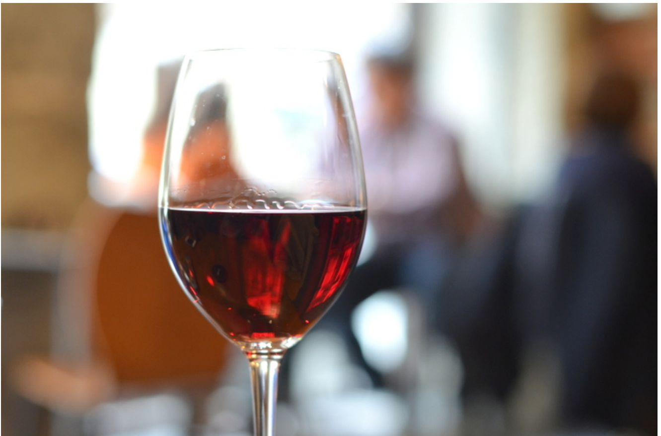
A deliciously smooth glass of Delito Garnacha

When a restaurant welcomes me with a wine list featuring labels like 'The Madman's Inn' and 'The Perfect Boyfriend', I'm intrigued. When they accompany it with a quality Thai-Spanish tapa and Motown, I'm hooked.