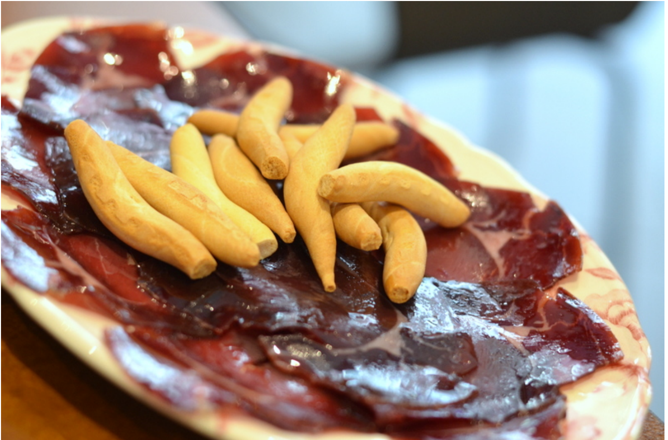
Mouth-wateringly marbled cecina