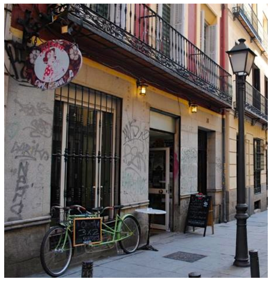
La Paca's facade on calle Valverde in Malasaña

As you walk through <u>La Paca</u>'s door, you feel like you're in the right place. This funky café in Malasaña is always a good choice when you're in the mood for a coffee, a beer, or something stronger.