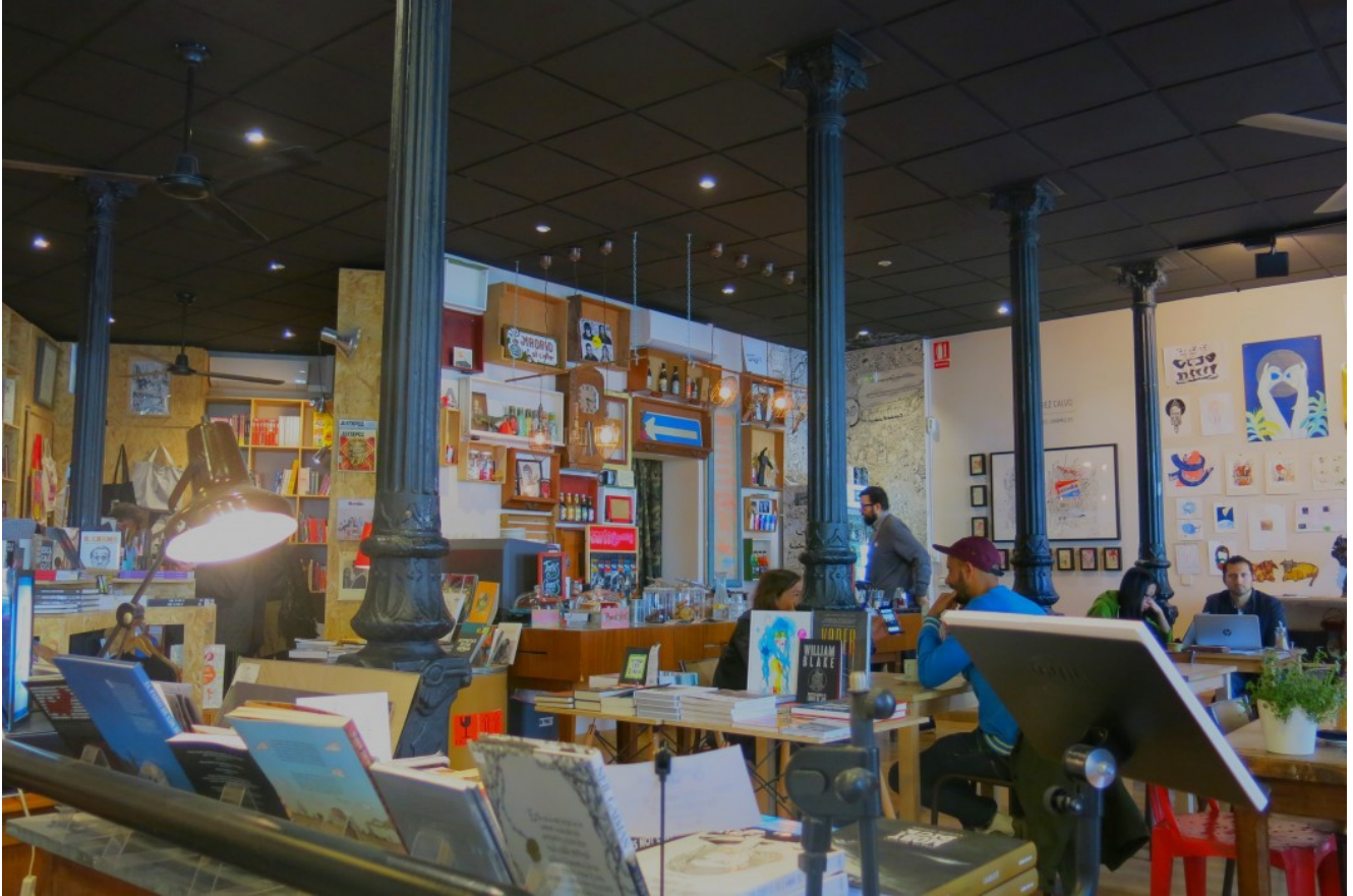
Swinton & Grant, Embajadores

Natural light streaks through black velvet curtains, revealing two main areas: on the first floor, Ciudadano Grant , a café-bookstore. In the basement, the Swinton Gallery , a large space for local artist exhibitions.