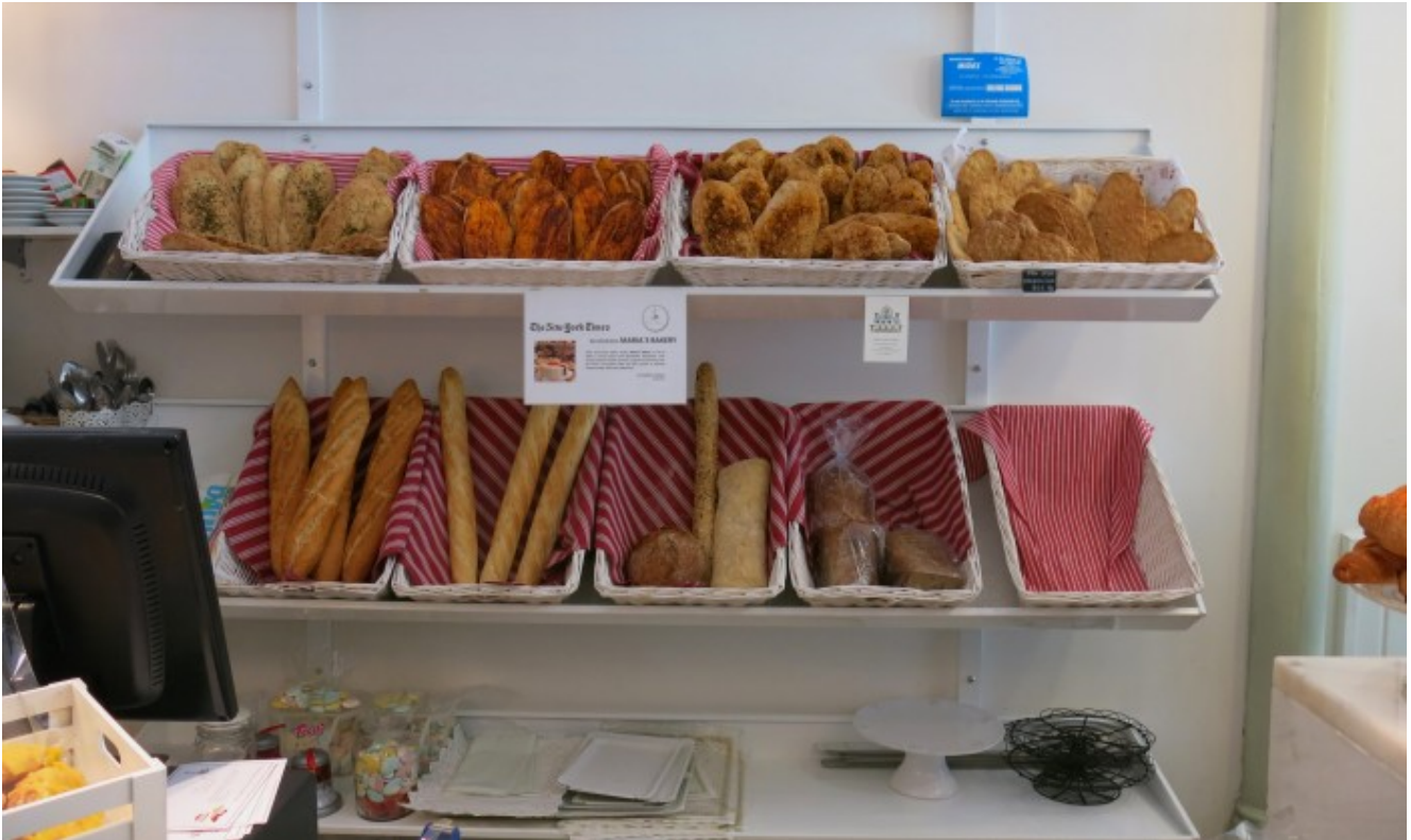
Maria's Bakery in Zurbano

de Bailey's," "tarta de queso con salsa de mora," even the oft-elusive "red velvet."