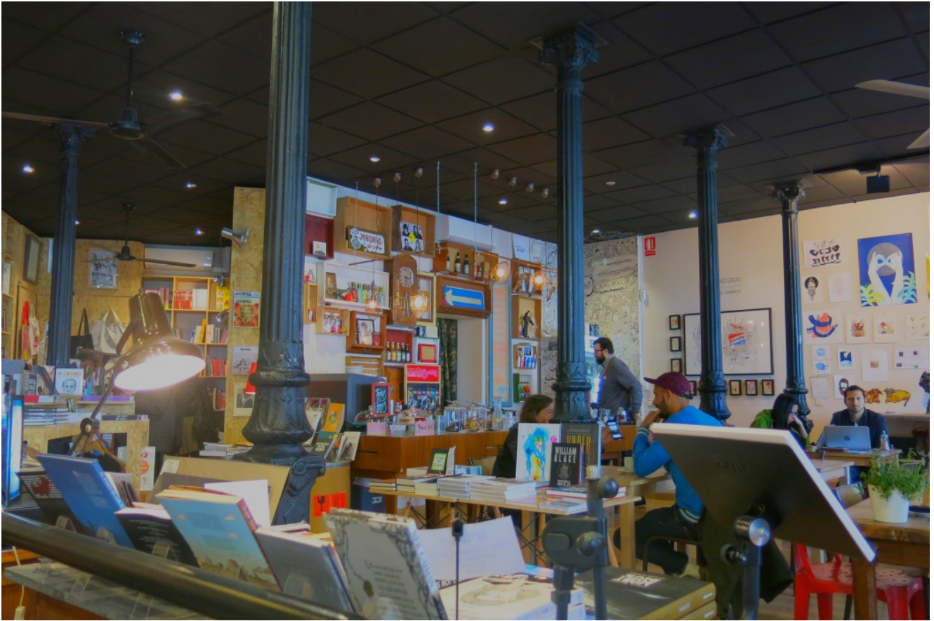
Swinton & Grant, Embajadores

a café-bookstore. In the basement, the Swinton Gallery , a large space for local artist exhibitions.