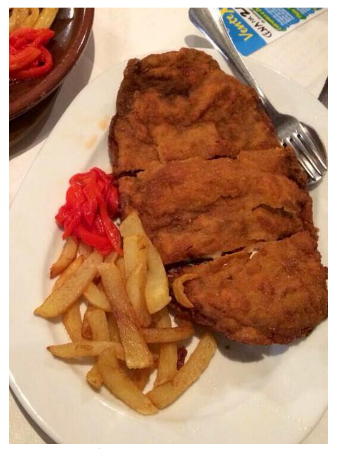
Cachopo at El Ñeru.

There are plenty of Asturian restaurants around this area but this one is my favourite. You can stand at the bar upstairs and gorge yourself on free tapas (try the cabrales cheese one) and dishes such as their magnificent cachopo, or you can take the weight off your feet and dine in the cavernous restaurant downstairs. It isn't the cheapest but it's worth it for the exquisite (and extremely filling!) food and excellent service.