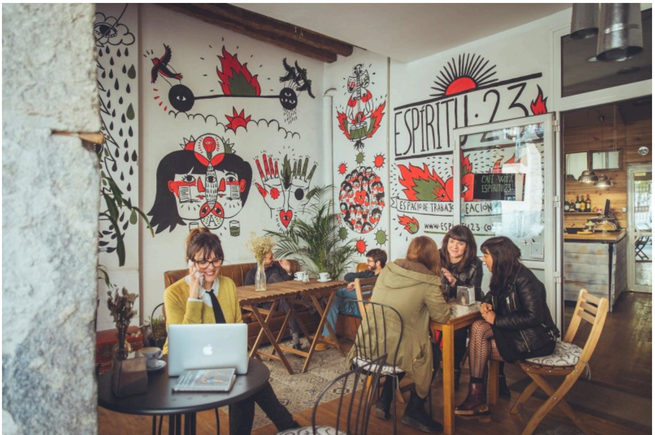
Image from Espíritu 23