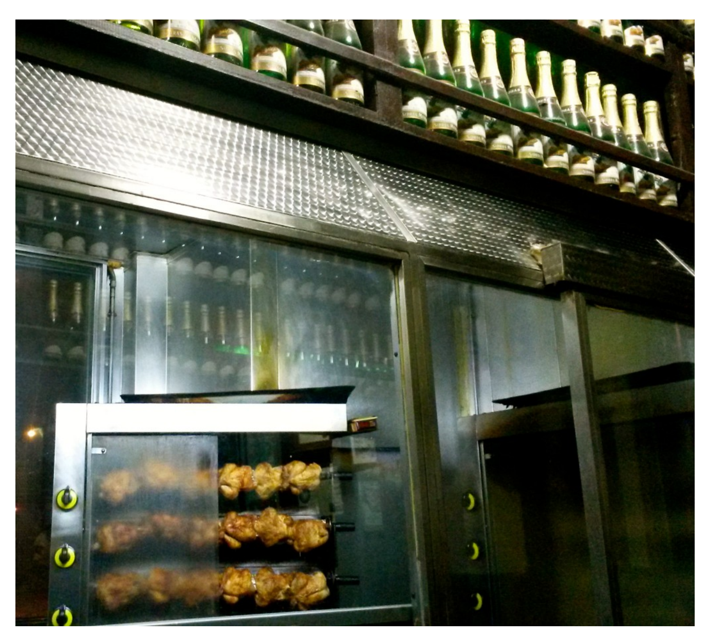
rotisserie chicken and endless cider at Casa Mingo

My favorite dishes are the roasted chicken and the roasted red peppers with tuna . And for dessert, try the tarta de sidra or tarta de santiago .