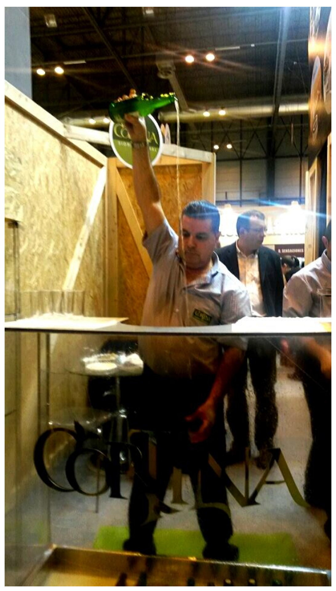
a professional showing how to pour cider the right