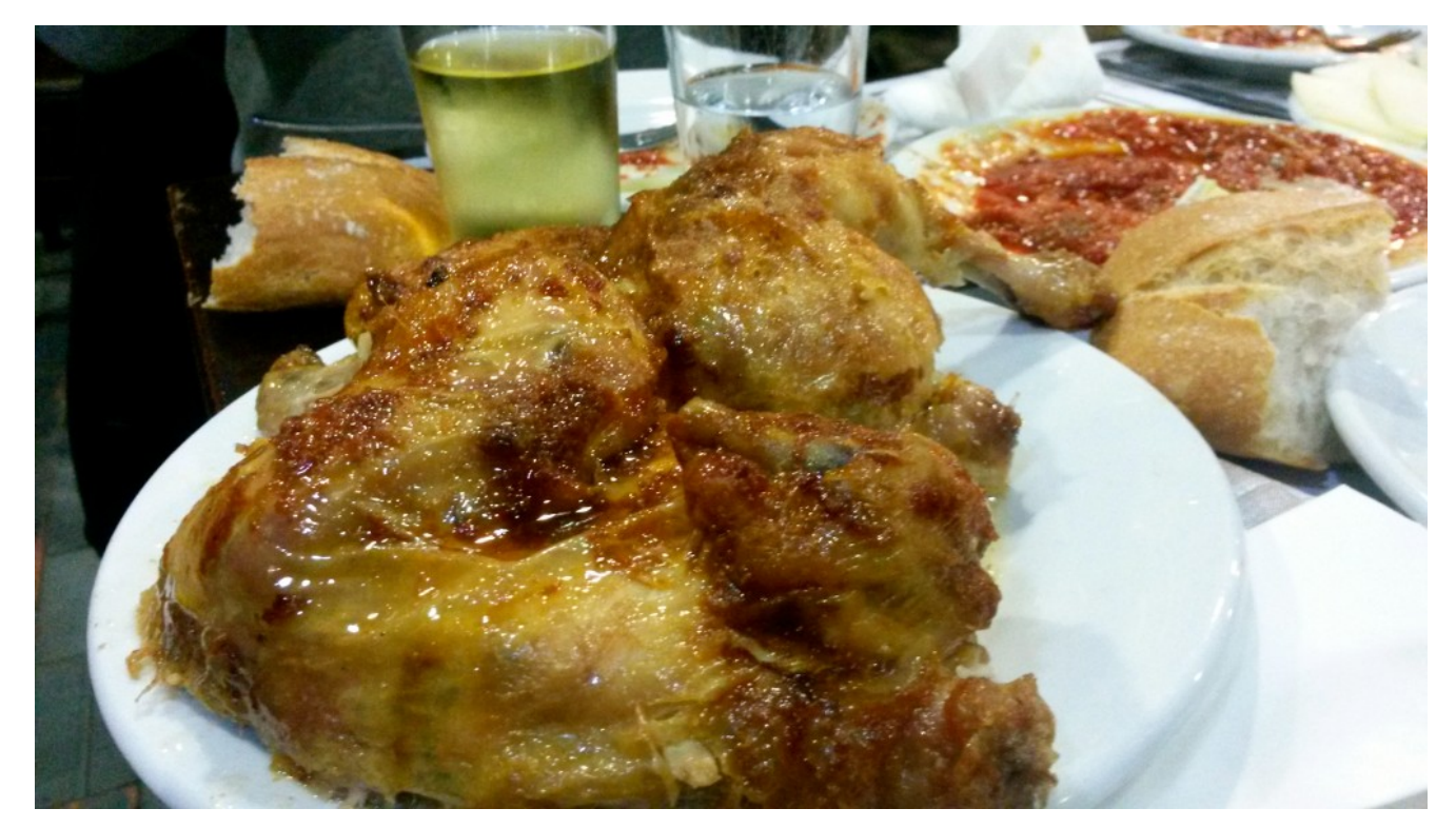
a whole roast chicken at Casa Mingo