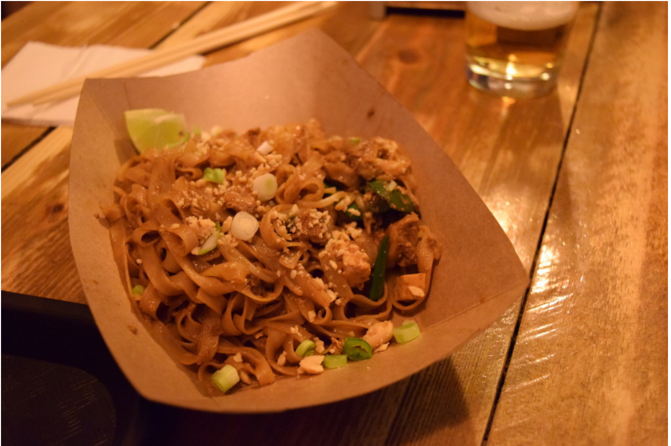
Pad Thai from Funky Chen

Not to mention the fact that prices are more than reasonable: you can get a roll or dimsum for as little as €1 or a bao for €4. Larger dishes range from €6 to €14. Asia Cañi even offers combo meals that include 2 rolls, curry, rice, and a drink for just €9.