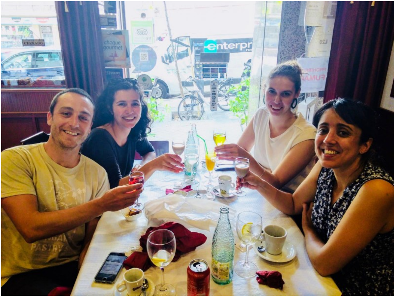
The management team at Atocha Tandoori!