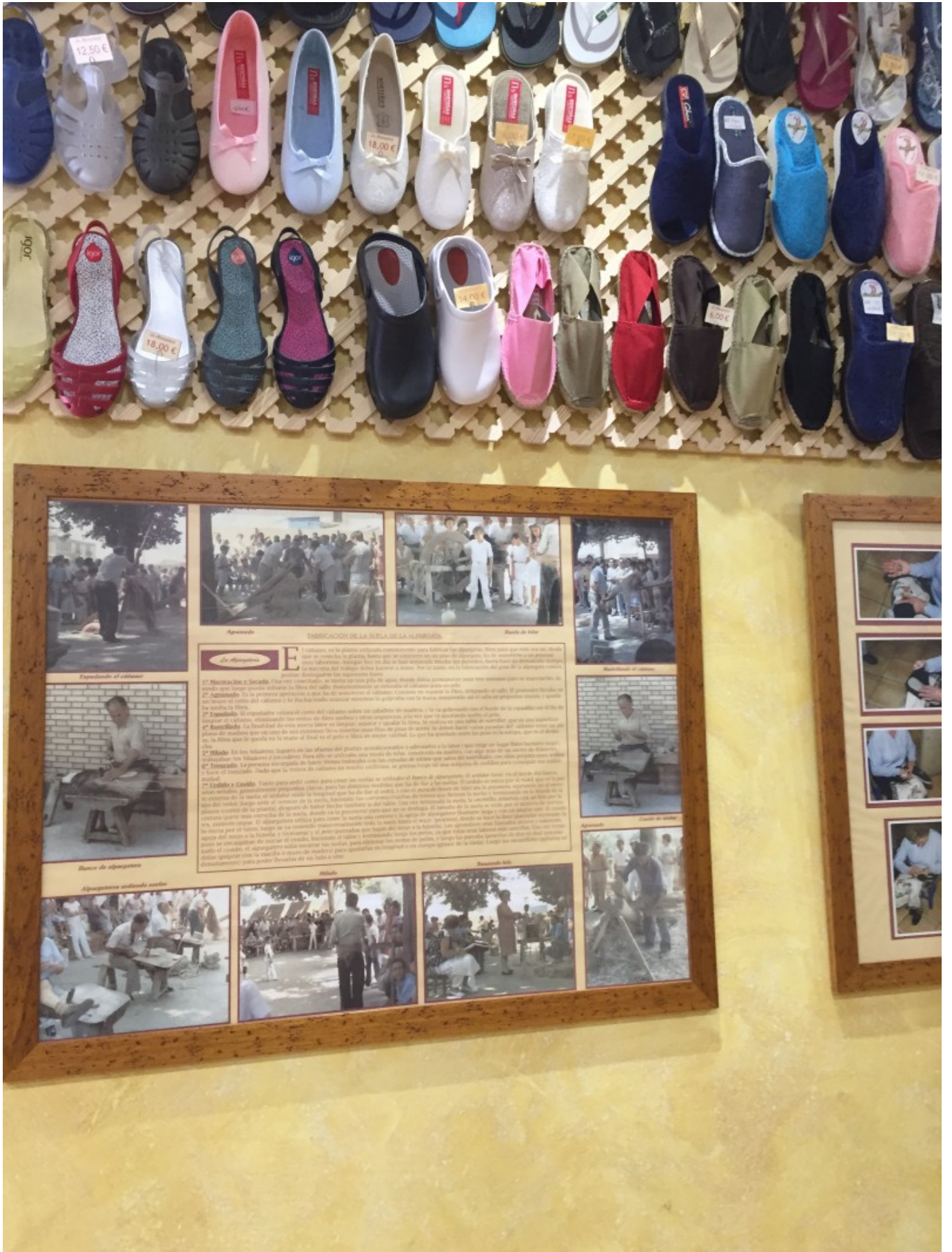
The most basic model, which comes in a whole plethora of colors, is €7.50. That's what I call a great quality/price