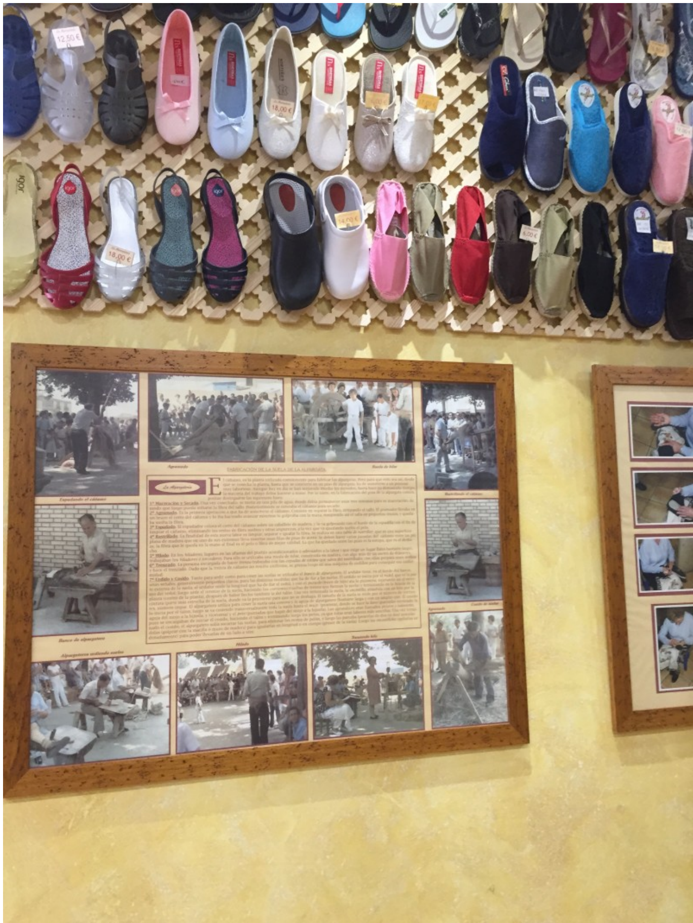
The most basic model, which comes in a whole plethora of colors, is €7.50. That's what I call a great quality/price