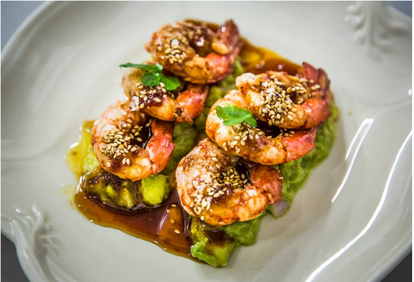
Gambones a la brasa – grilled shrimp

I was warned by the hip (but not scarily so staff) that if you want a table on a Saturday night you need to be booking up about a week in advance. My concern is that after a rave review that might up the ante to a fortnight. Either way, Lady Madonna is the kind of place that cocoons you with its culinary chicness but has you pining for your Oysho jammies by the time you pay the bill (or maybe that's just me/an attack of my eyes being bigger than my belly!).