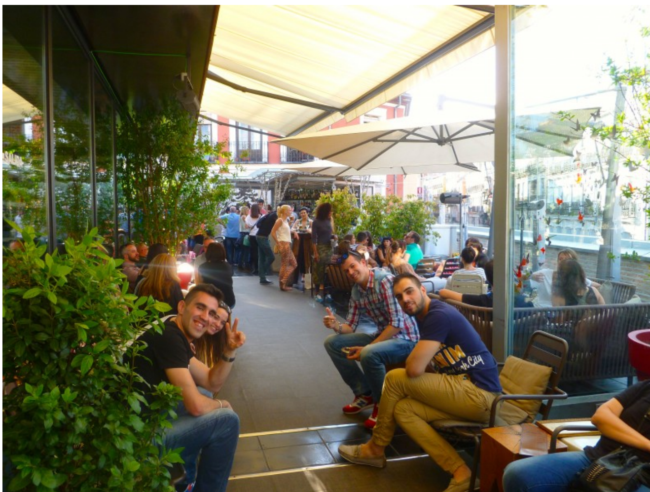
At Mercado de San Antón's rooftop, just across the street from Plaza de Chueca

terraces and boutiques, especially a whole street of shoe stores on c/ Augusto Figueroa . Also along this street is another highlight— Mercado de San Antón —a 3-story gourmet food market offering all types of delicious food and a fantastic rooftop bar . Chueca is also proudly home to one of the world's largest Gay Pride Parades, as well as many other city activities. For its mix of edgy and high-end nightclubs, restaurants, bars, stores and ambience, Chueca is easy to fall in love with.