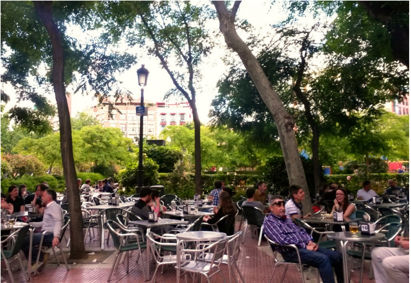
my favorite plaza in Madrid, Plaza Olavide