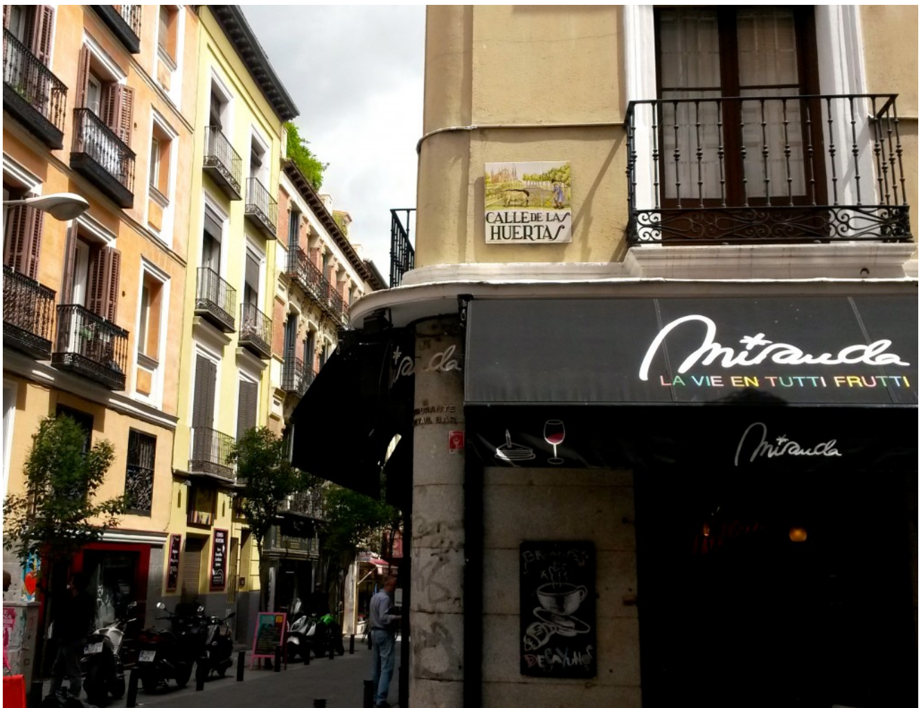
where calle huertas meets calle leon

bars, some upscale and some divey, plus lots of great restaurants too. There are many other little streets to discover such as Calle Leon (on the left in the photo below) also lined with fun bars and old-school delicatessens, boutiques and more. One of Huertas' highlights is Restaurante Meceira (amazing Galician food) and Bar Populart (often called Madrid's best jazz bar), though the list goes on. If you walk down Huertas street , you'll end up on the Castellana , Madrid's largest boulevard which at that point is actually called Paseo del Prado , full of museums and sightseeing activities, thus turning Huertas into a good day-neighborhood as well.