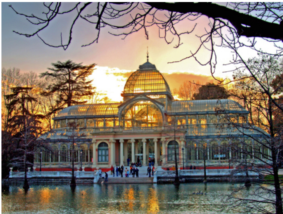
Palacio de Cristal

It is an easy pick but a great place to start with because you get away from the noise and hectic life of the city. You invite your date for an aperitivo to the café (on paseo Venezuela) next to the pond in the centre of the park. However you shouldn't linger too long with the drinks. After the first copa you should take your date to Palacio de Cristal in Retiro or show them the now abandoned zoo that used to be in Retiro.