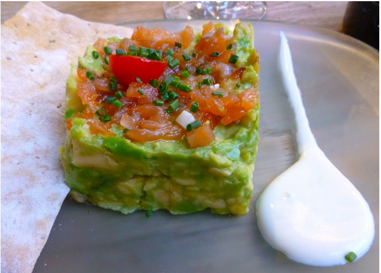
tartar de aguacate con salmon

Although the Spanish passion for croquettes is not always understood by foreigners, las croquetas de jamón are a must here too, as are the albóndigas (meatballs). Since I always order them both, last week I decided to venture out a bit and went for the mini-hamburgers instead, and wow, that was a good choice. They're served with a reduced Pedro Ximenez (sherry) sauce which you can sop up with bread.