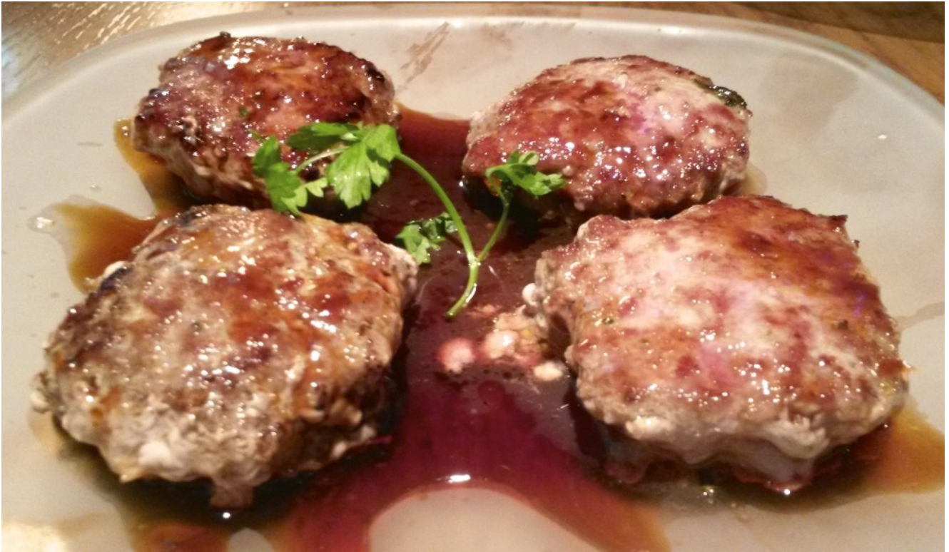
mini hamburguesas con reducci3n de Pedro Ximenez (sherry reduction)

One of our latest and most surprising discoveries was the tortilla de patata (Spanish potato and egg omelette). This Spanish staple is so common that it had never occurred to us to order it at Lateral . But don't be fooled, please do try their tortilla de patata right away. It's really one of the best I've had in Madrid.