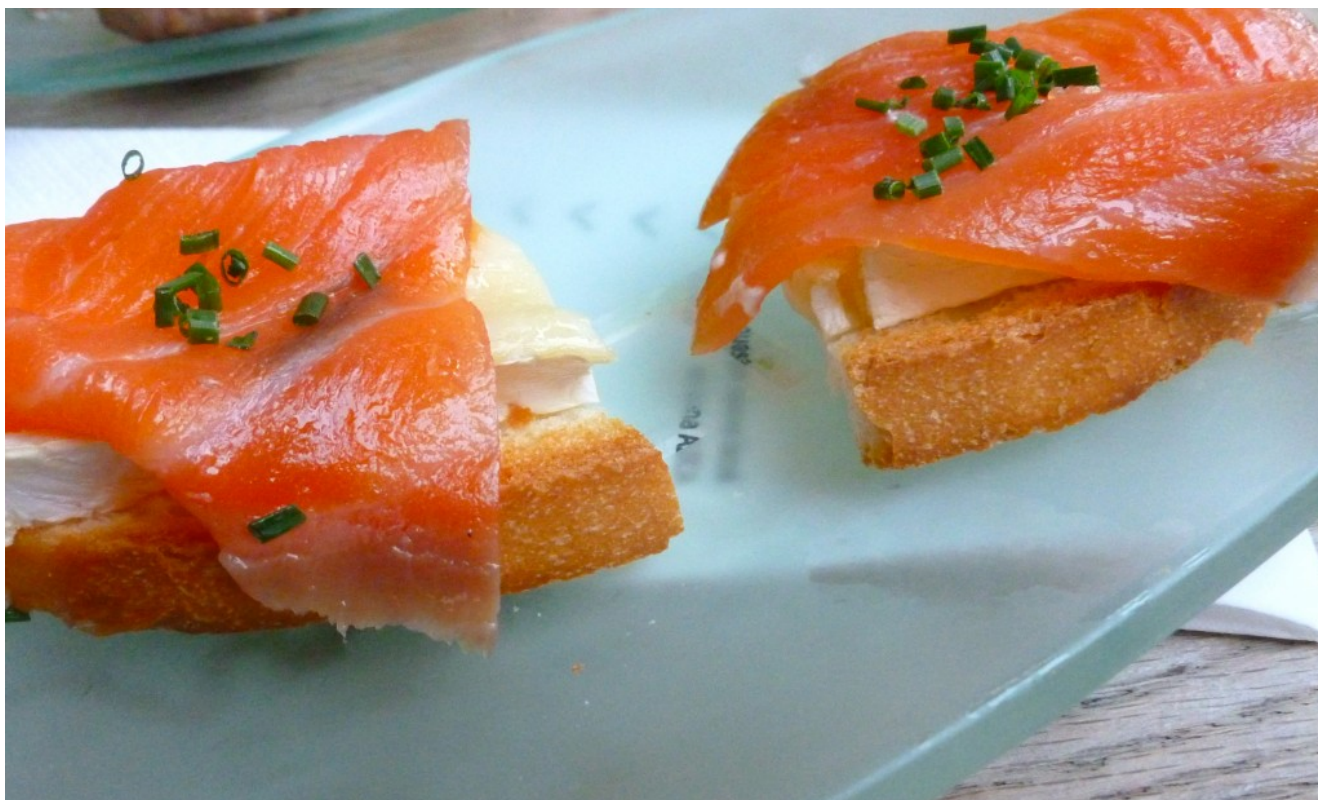
tosta de salmon con brie

For something light, you should try the gazpacho, tartar de aguacate con salmon (fresh avocado topped with salmon, tomato and chives) and the tosta de salmon con queso brie (smoked salmon and brie cheese on a slice of toasted bread).