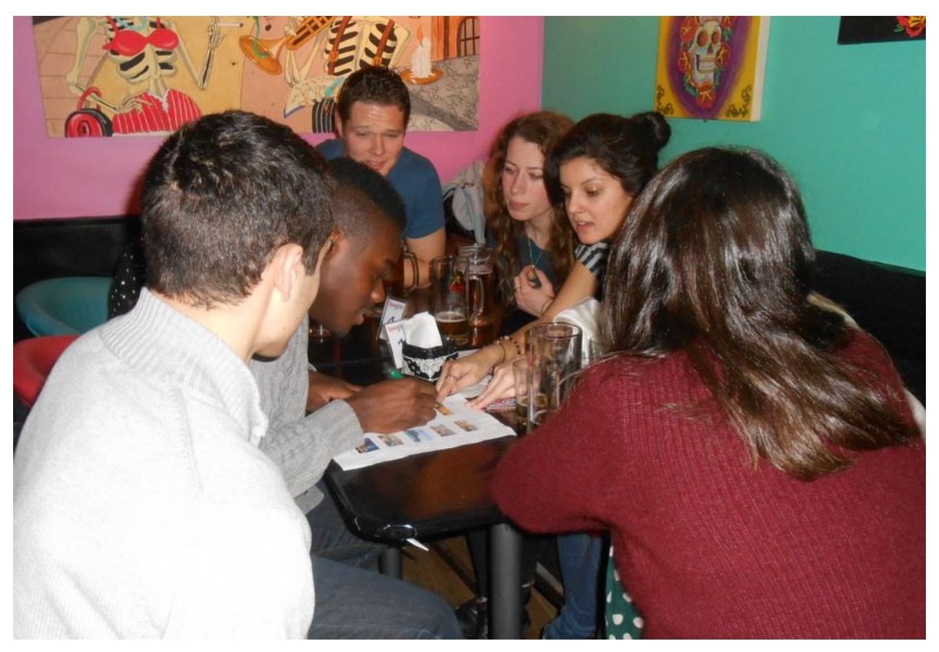
trying to spot movie scenes from images in which the bodies have been cut out

were given ten photos from different movie scenes. The people in the pictures were cut out, and we were asked to identify the movie without seeing any remnants of skin, hair or eyes (we killed that round!).