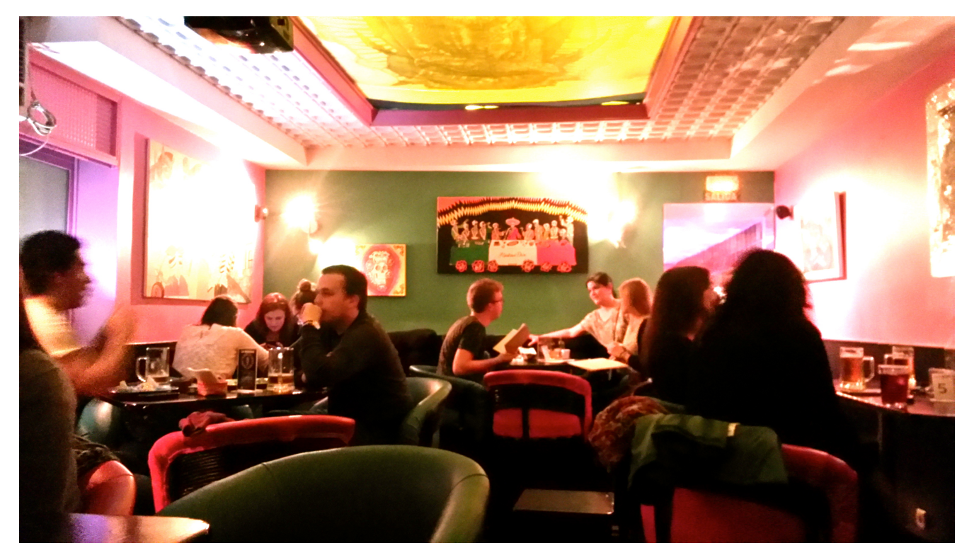
Before it gets packed for Beerlingual's pub quizzes at La Morena

Matt says that lots of people come in pairs or even solo, so they try to add them to existing groups. Combining people from different countries also turns the event into a language exchange as well as a pub quiz.