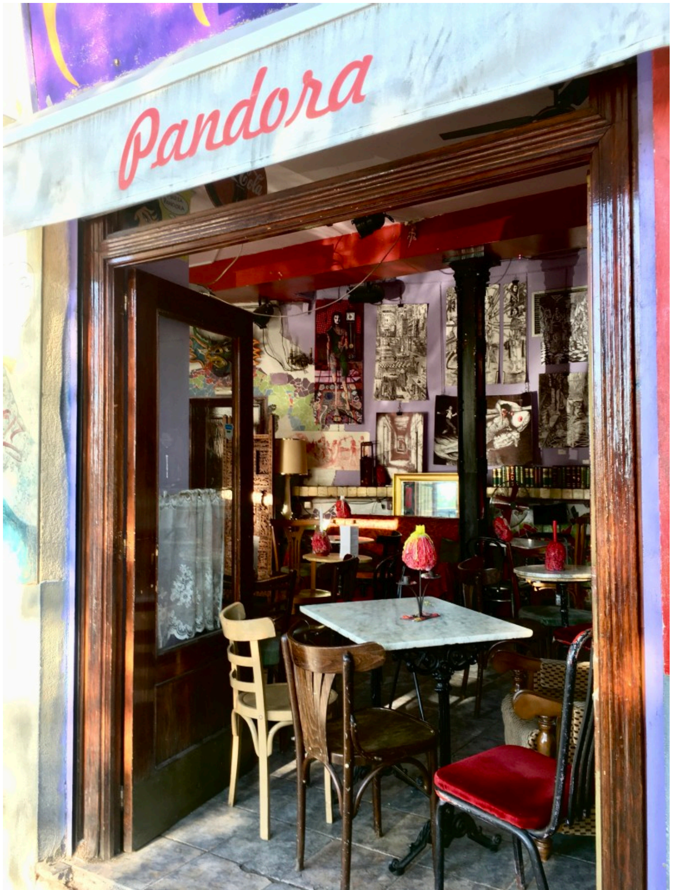
Cryptic, dripping golden letters read MARÍA PANDORA, and the sound of a dramatic poetry reading demand the curiosity of