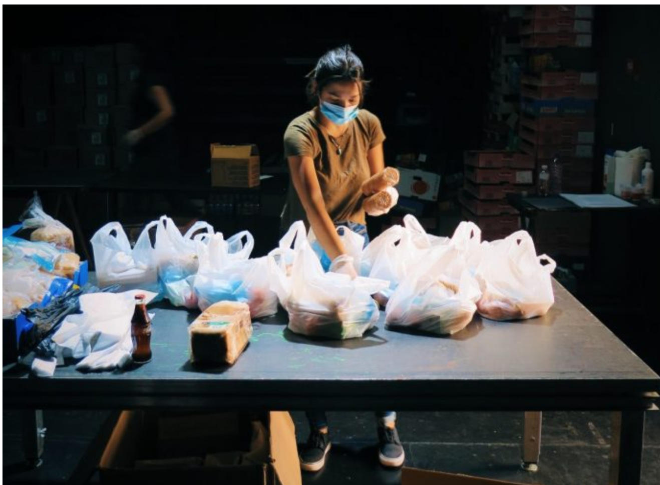
Image from Madrid No Frills' story on Dragones de Lavapiés and its sister platform La CuBa

Dragones de Lavapiés is just one food bank that has sprung up since the pandemic took hold. What was once a local football club for migrant children, is now a precious lifeline for endless counts of vulnerable families in the neighborhood.