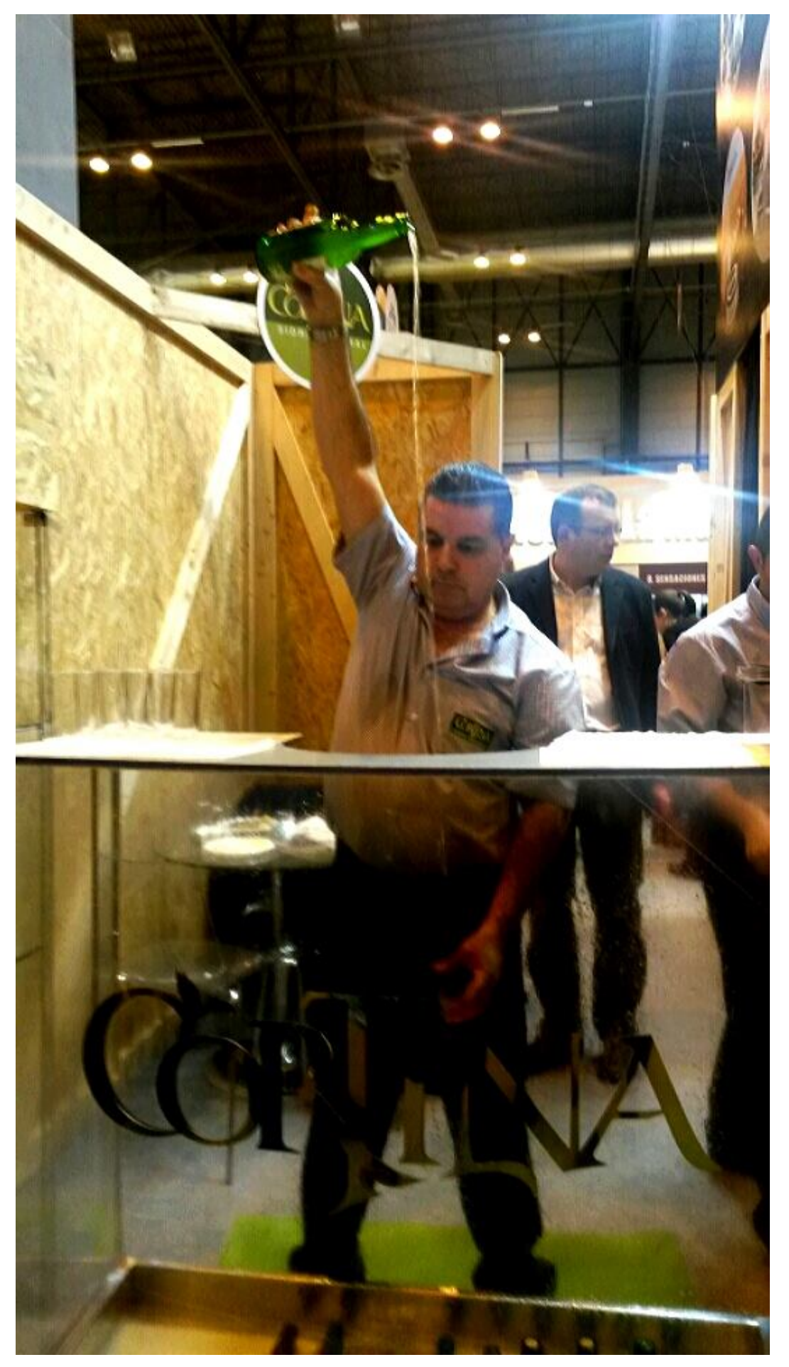
a professional showing how to pour cider the right