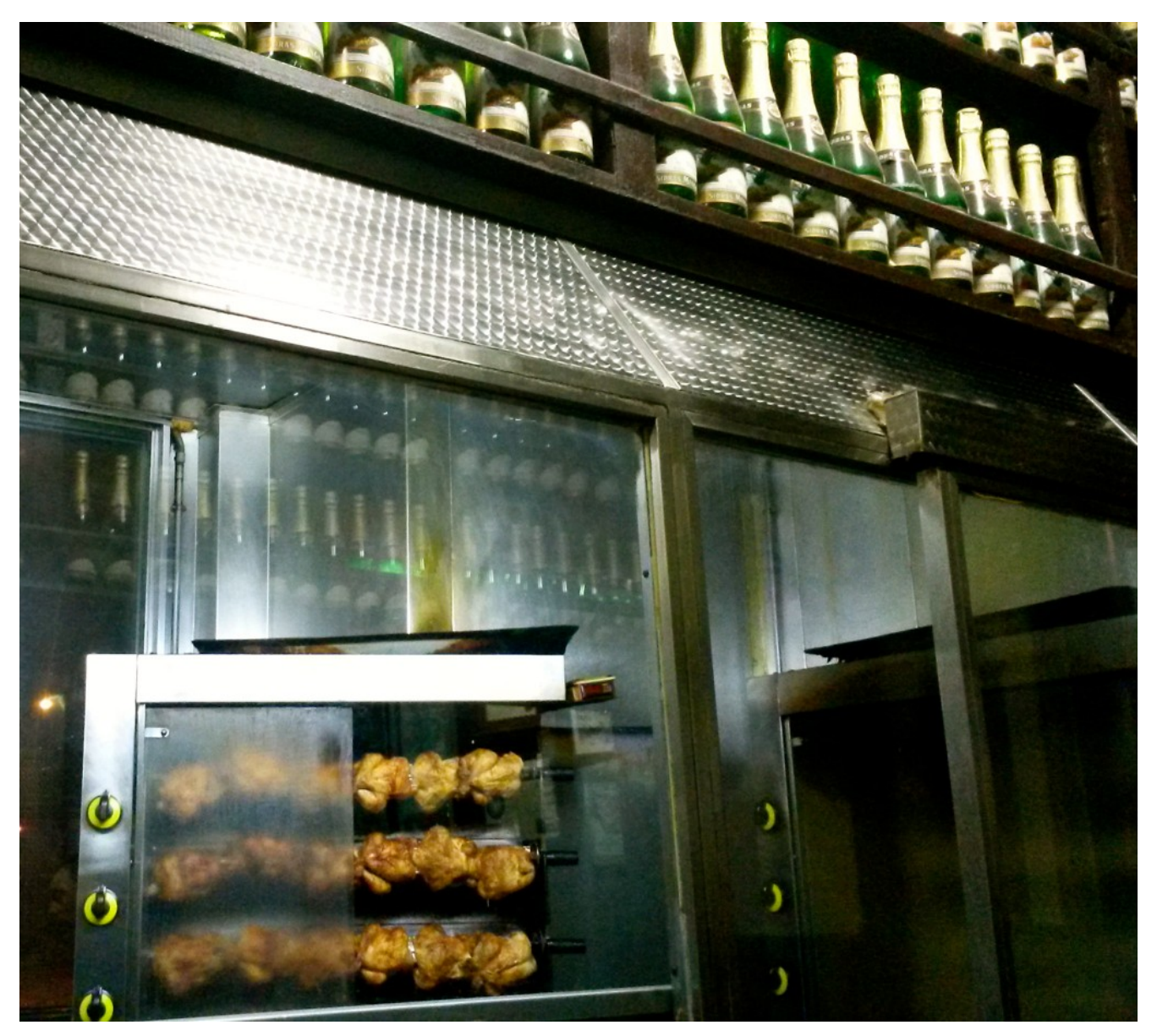
rotisserie chicken and endless cider at Casa Mingo

My favorite dishes are the roasted chicken and the roasted red peppers with tuna . And for dessert, try the tarta de sidra or tarta de santiago .