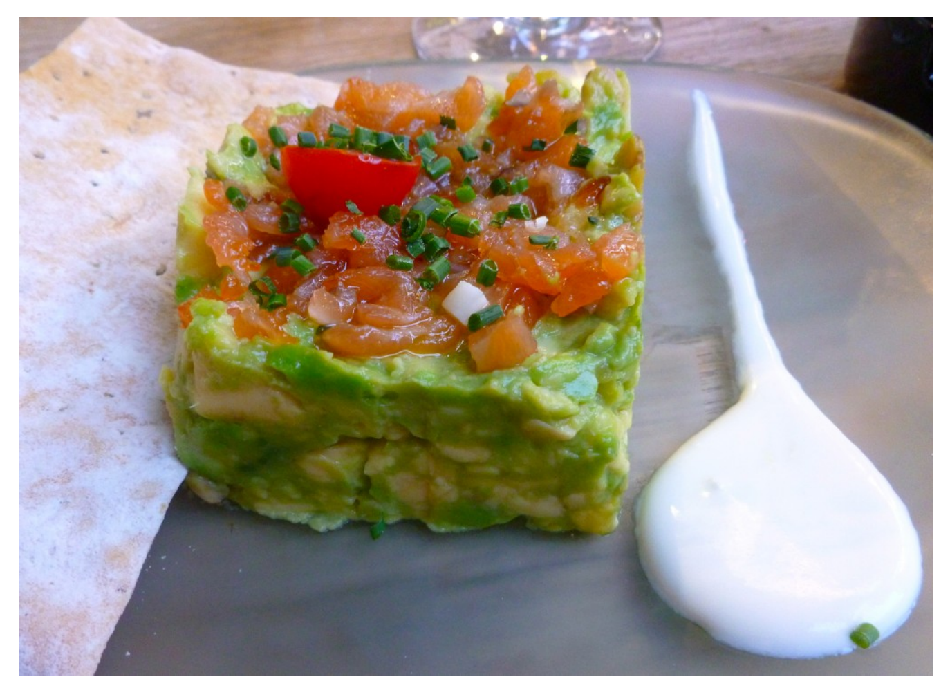
tartar de aguacate con salmon

Although the Spanish passion for croquettes is not always understood by foreigners, las croquetas de jamón are a must here too, as are the albóndigas (meatballs). Since I always order them both, last week I decided to venture out a bit and went for the mini-hamburgers instead, and wow, that was a good choice. They're served with a reduced Pedro Ximenez (sherry) sauce which you can sop up with bread.