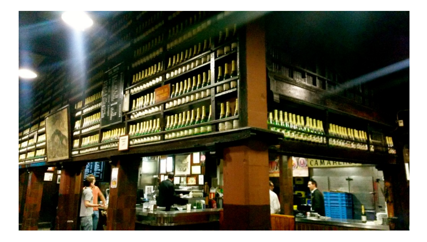
An Asturian cider house serving traditional, simple and exquisite rotisserie chicken since 1888, Casa Mingo is the real deal—no frills, no fuss, just the good stuff. The high walls are lined with bottles and barrels, making you feel as though you've been immersed in a sea of cider. And although the wooden floors are holding up, the wear and tear are evident. Be sure there's no intention of refurbishing this wooden tavern. Its notable use and warm simplicity is what makes it so special.