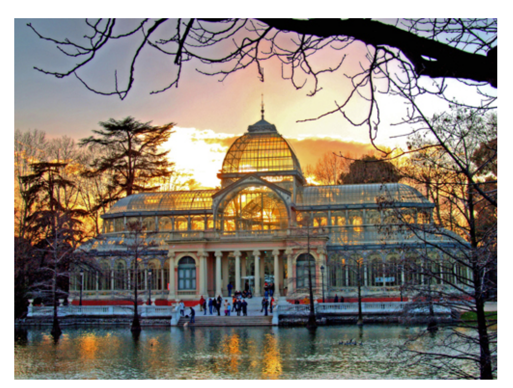
Palacio de Cristal

It is an easy pick but a great place to start with because you get away from the noise and hectic life of the city. You invite your date for an aperitivo to the café (on paseo Venezuela) next to the pond in the centre of the park. However you shouldn't linger too long with the drinks. After the first copa you should take your date to Palacio de Cristal in Retiro or show them the now abandoned zoo that used to be in Retiro. For both do a little research and make sure how to get there because you can get easily lost. My personal favourite is the rose garden located towards the side of Av. De Menendez Pelayo. It is incredibly impressive when you walk along and are met by a resident peacock. It will also take you to the restaurant. If the sun is setting though take the route to Palacio de Cristal .