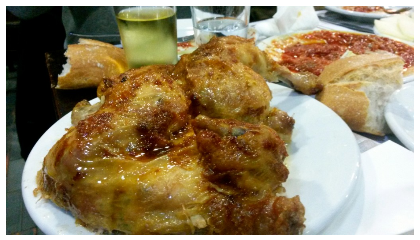
a whole roast chicken at Casa Mingo