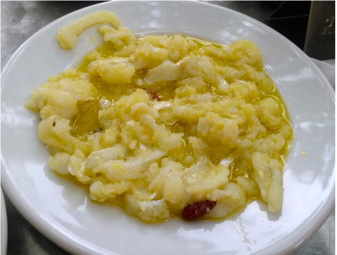
I'm not very fond of fish, but this bacalao was superb.