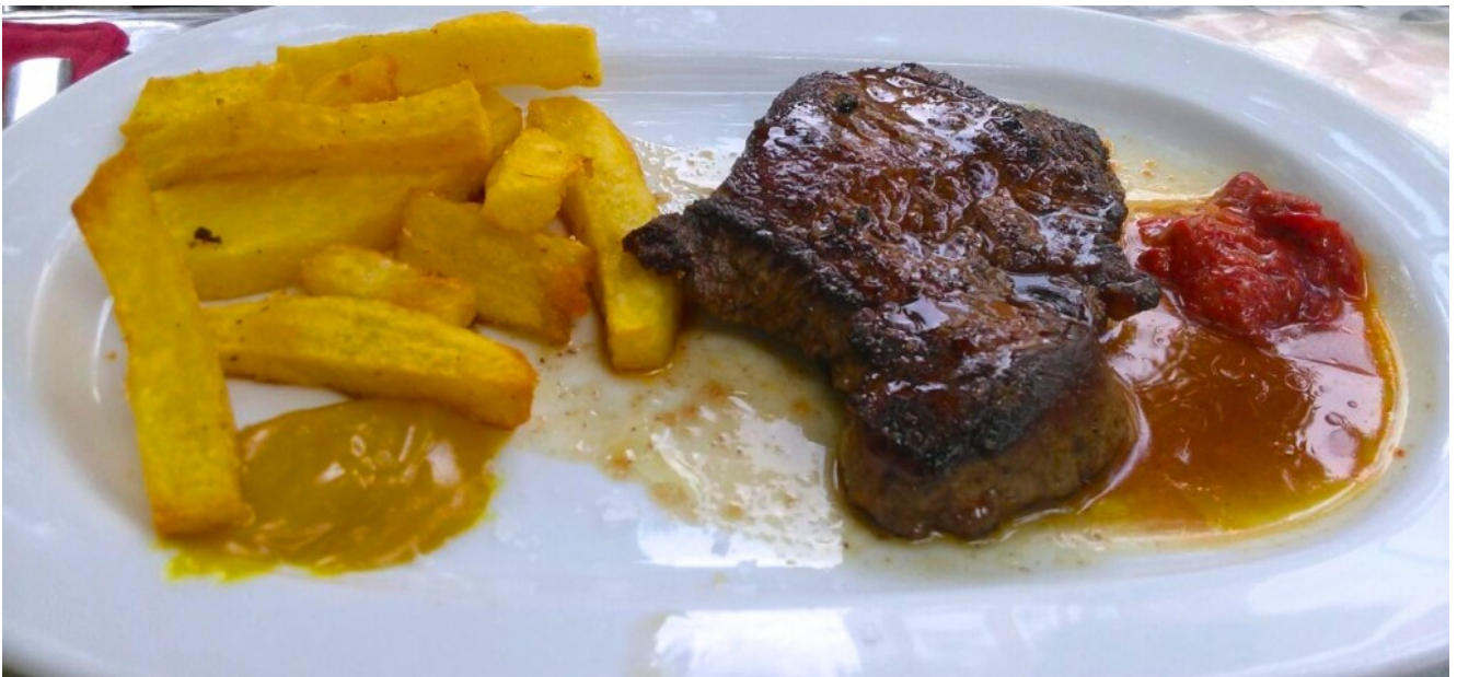
The entrecot was so big that we had to ask the waiter to split it in two. This pic only shows half.